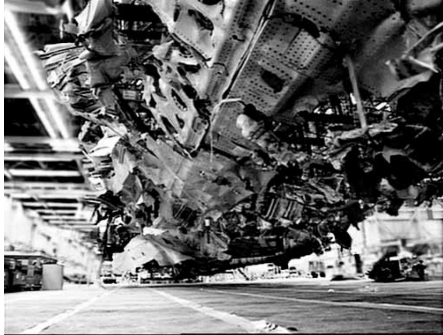
Reconstructed wreckage, Calverton, Long Island, 6 February 1997.

Other descriptions from eyewitnesses who for whatever reason did not report hearing sounds supported this conclusion. For example, a passenger on USAir Flight 217 reported seeing an aircraft fly under him 10 seconds before the appearance of “a small, flare-like projectile traveling in an east-northeasterly direction.” Radar tracking of Flight 217 and the small aircraft—later confirmed to be a Navy P-3 Orion—shows that he first saw the flare-like object at about the time Flight 800’s CVR detected an onboard explosion. He also specified where the flare-like object first appeared, which coincided with Flight 800’s location when it exploded. And his statement that the flare-like object was traveling in an east-northeasterly direction