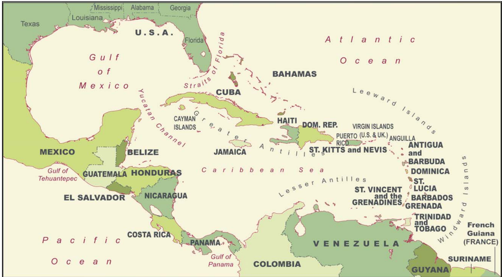
Figure 1. Map of the Caribbean Basin