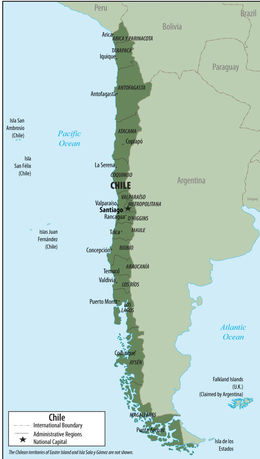
Figure 1. Map of Chile