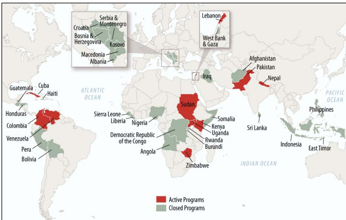
Figure 1. USAID Office of Transition Initiatives Programs, 1994-2008

Source: http://www.usaid.gov/our_work/cross-cutting_programs/transition_initiatives/country/index.html , modified by CRS.