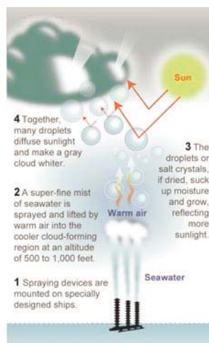
Figure 2. Cloud Whitening Schematic