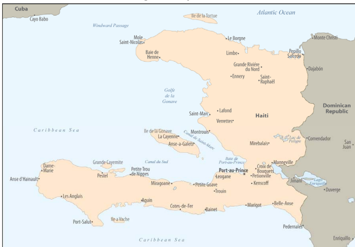
Figure I. Map of Haiti