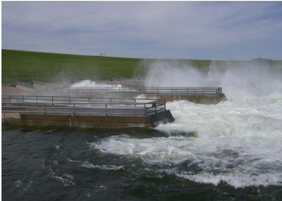
Figure 4. In 2011, the flood tunnels at Oahe Dam released a record volume of water. The earthen-channel spillway (not shown) was not used to avoid damages and the need for costly repairs. (Photo taken June 2011.)