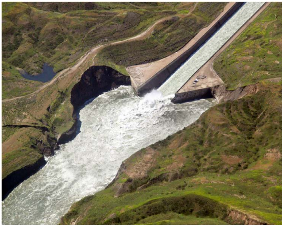
Figure 6. Severe erosion along the wing walls of the Fort Peck spillway plunge pool.

Prolonged, record-level releases caused significant erosion to the spillway plunge pool and damaged the spillway discharge channel. (Figure 6) Although repairs are being completed with DRAA funds for the most immediate erosion damage, there is concern that future sustained high releases might further erode the earth around the west wing wall or uplift the spillway floor slabs, creating a significant dam safety concern. Restoration to return full design function to the spillway could potentially include armoring the plunge pool, reconstructing/reinforcing the cutoff wall and wing walls, modifying the spillway, adding energy dissipaters, or a combination of these measures.