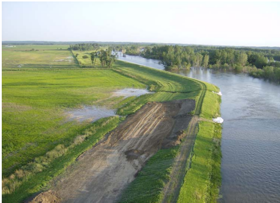
Figure 5. The levees along the Missouri River were subjected to prolonged water loading. Consequently, many suffered from erosion and underseepage, necessitating extensive repairs. (Photo taken June 2011 of levee L575 near Hamburg, Iowa.)

Although levees protect property within the floodplain, they also reduce the flow area available for the passage of flood waters, resulting in higher and faster water flow during high water events. In 2011, the flood waters carried excess energy which acted on the river corridor. The extreme high flood flows tended to travel across bends in the most energy efficient manner, severely degrading channel training structures such as dikes and revetments. Sediment traveled with the flood flows, causing both scour and deposition at different locations. Recreation facilities, plant and wildlife habitat, and historic tribal sites 2 along the river channel were also impacted by the force of the flood waters and will require assessment and possibly rehabilitation.