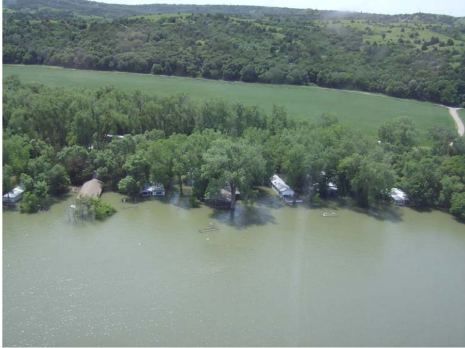
Figure 3. The Missouri River flood of 2011 inundated homes, businesses and agricultural lands. Highways, bridges, railroads, and other infrastructure were also impacted. (Photo taken in June 2011 below Ft. Randall Dam.)