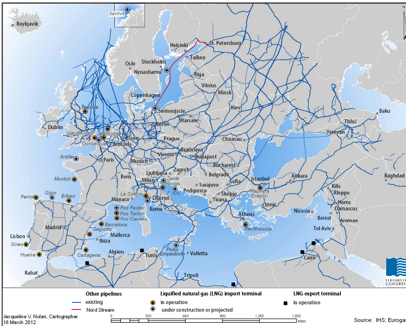
Figure 3. Select European Natural Gas Infrastructure