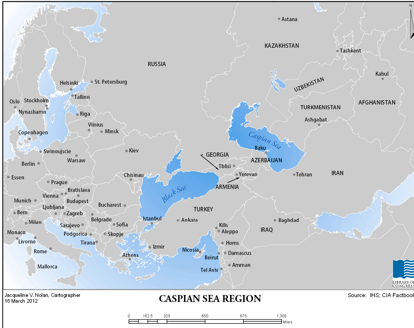
Figure 4. The Caspian Region