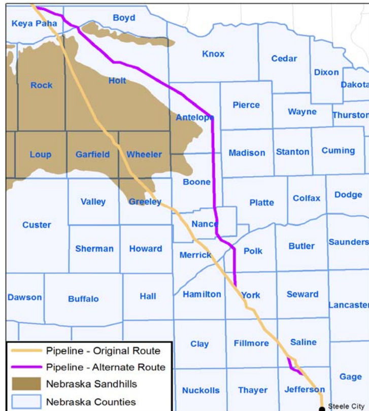
Figure 2. Keystone XL Preferred Alternative Route in Nebraska