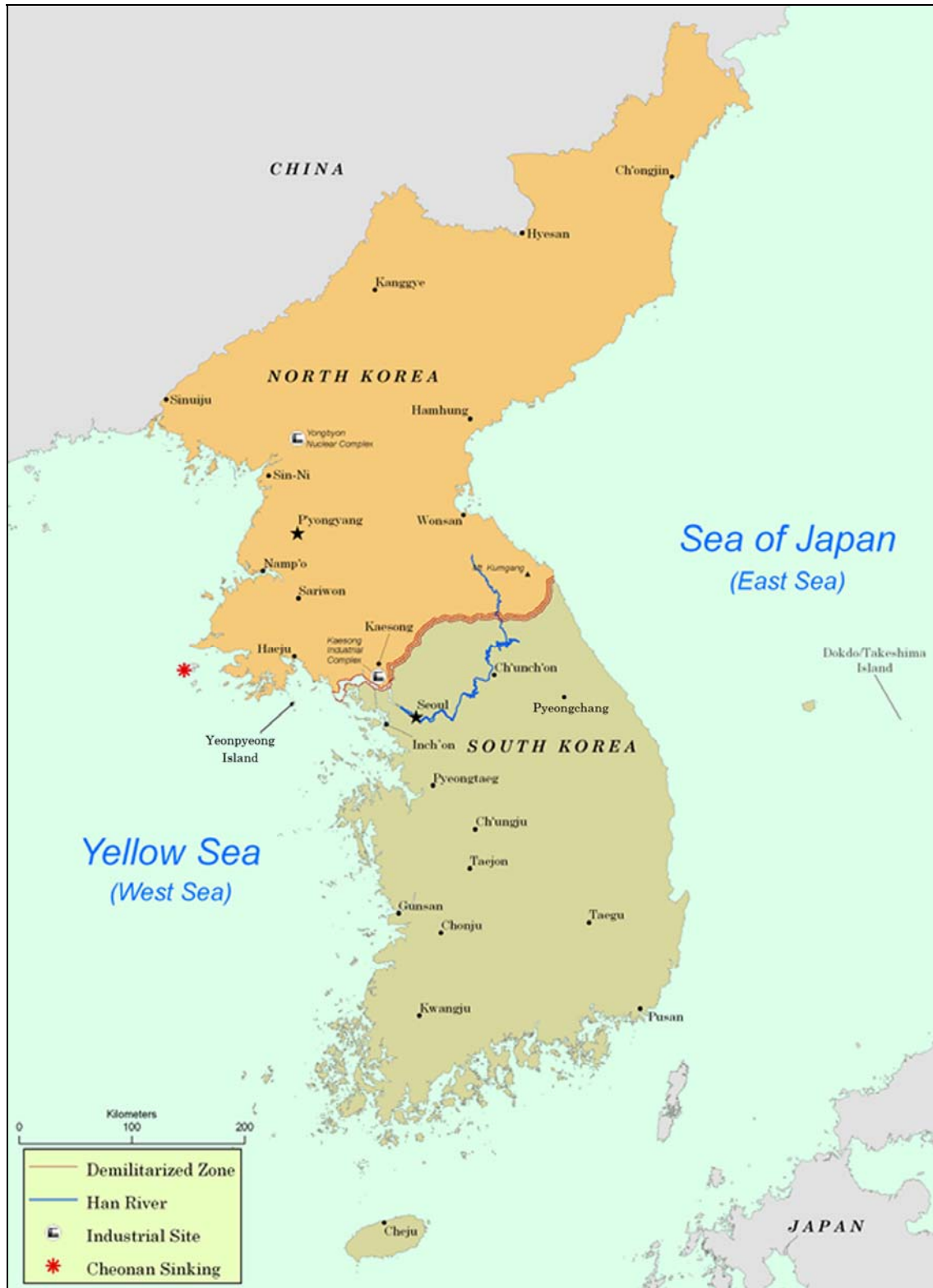
Figure I. Map of the Korean Peninsula