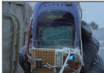
Figure 3. An EOD Technician Holds Up a DTMF IED Triggering Device Found in Iraq. 15

The second item is the Dual-Tone Multi-Frequency (DTMF) Board. This technology was originally designed as circuitry for automated telephone systems, using touch-tone dialing to navigate the system. 13 However, as a field expedient circuit board, it is the triggering mechanism for Radio Controlled IEDs. 14