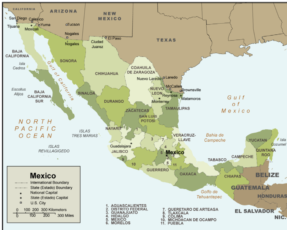
Figure I. Map of Mexico, Including States and Border Cities

Over the past decade, Mexico has transitioned from a centralized political system dominated by the Institutional Revolutionary Party (PRI) to a multiparty democracy in which presidential power is increasingly constrained by Congress, the Supreme Court, and the country's governors. 1 President Felipe Calderón of the conservative National Action Party (PAN) won the July 2006 presidential election in an extremely tight race, defeating Andrés Manuel López Obrador of the leftist Party of the Democratic Revolution (PRD) by fewer than 234,000 votes. President Calderón began his six-year term on December 1, 2006. He is to be succeeded by Enrique Peña Nieto of the PRI, whom Mexico's Electoral Tribunal recently certified as the victor in Mexico's July 1, 2012, presidential elections. President-elect Peña Nieto is scheduled to take office on December 1, 2012.