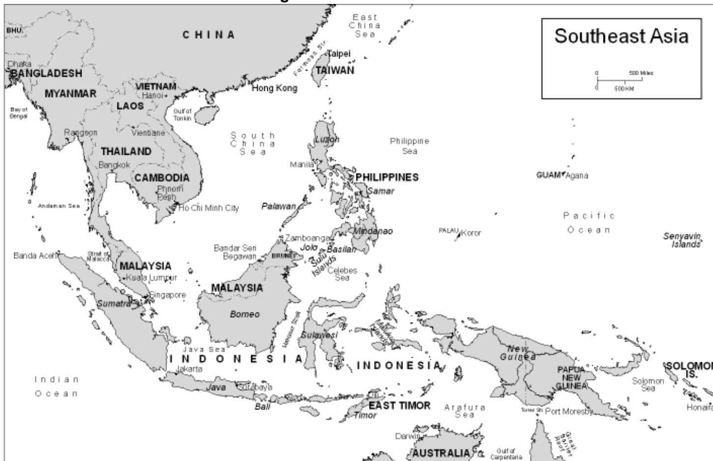
Figure 2. Southeast Asia

Source: Map Resources. Adapted by CRS. (R. Woods 8/18/03)