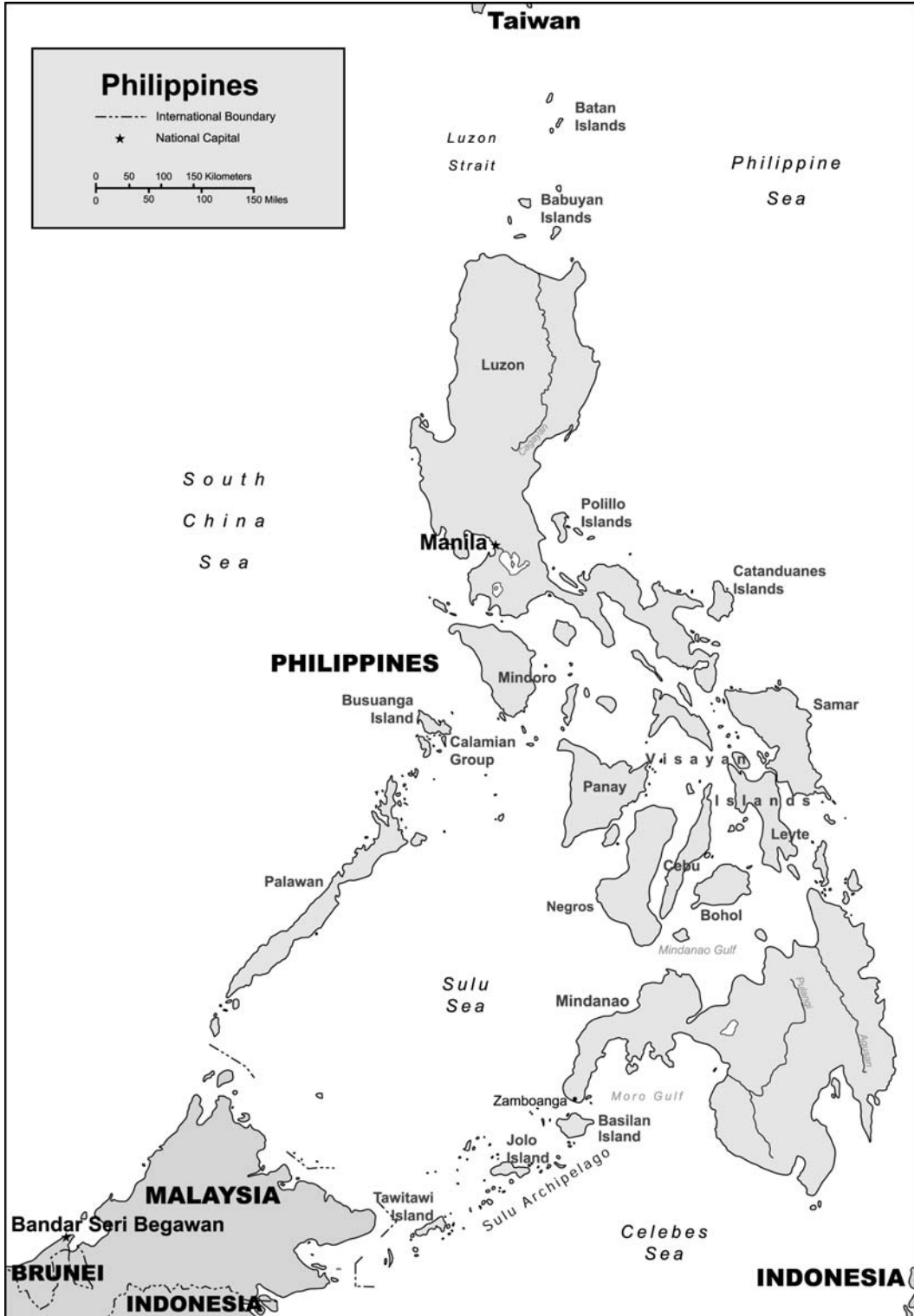
Figure 5. The Philippines