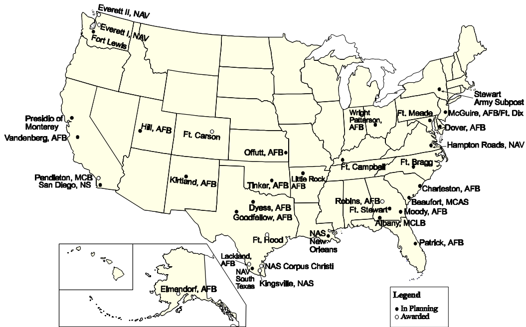
Figure 1. Military Housing Privatization Projects, May 2001