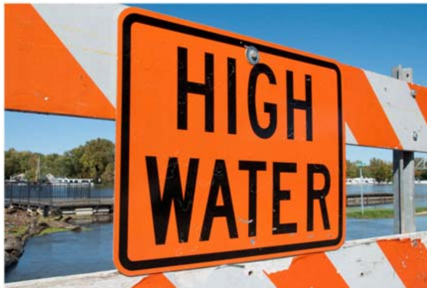
Figure 5 - Road in Red Wing, Minnesota, is closed due to flooding

While not responsible for developing an evacuation plan, levee owners and operators are encouraged to maintain close contact with appropriate government agencies during emergencies to provide timely and accurate information on levee conditions.