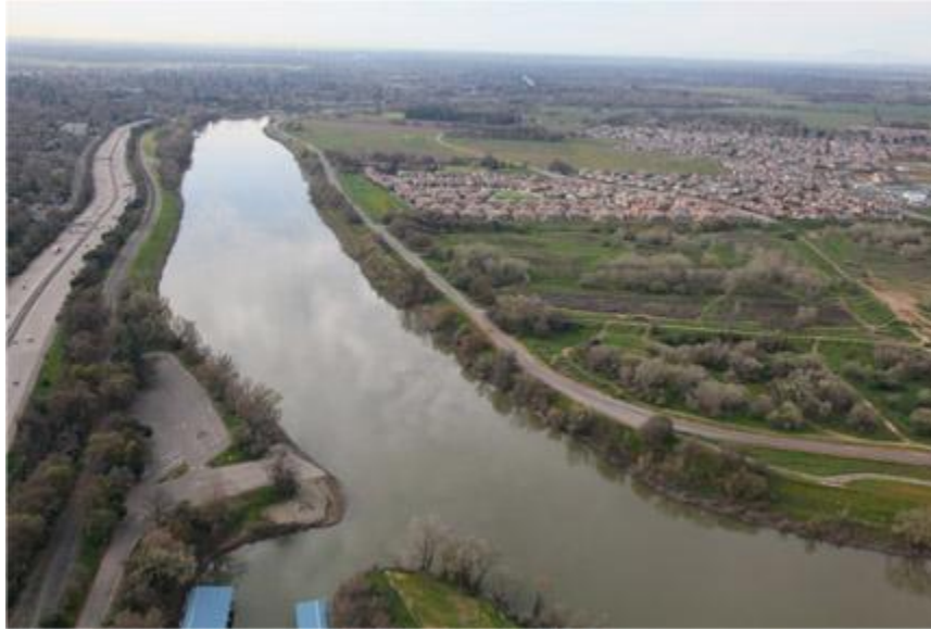
Figure 1 - Sacramento River at Miller Park, Sacramento, California

Emergency planning may cover other key aspects such as potential assembly or staging areas for flooding events, location of earth borrow sites, and procedures for maintaining records of equipment, manpower, and supplies. Understanding no plan can guarantee that a levee system will not fail under all circumstances, levee owners and operators are encouraged to work with local public safety officials to assist them in developing effective evacuation plans.