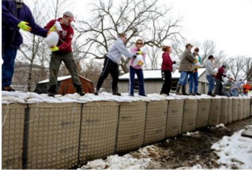
Figure 7 - Volunteers raising emergency levee in Valley City, North Dakota