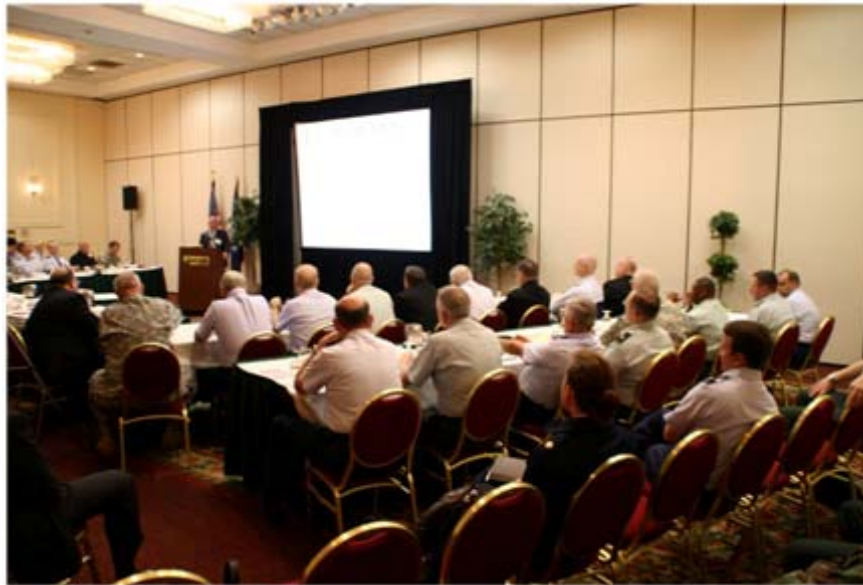
Figure 6 - Government representatives, non-governmental organizations, and private industry partners participating at an exercise in Baton Rouge, Louisiana

Exercise activities may include participation in State and local emergency exercises where levee personnel can interact with multiple public safety agencies. Additional opportunities to identify improvement actions may be found through the review of the levee emergency preparedness plan after an activation triggered by a real-world incident.