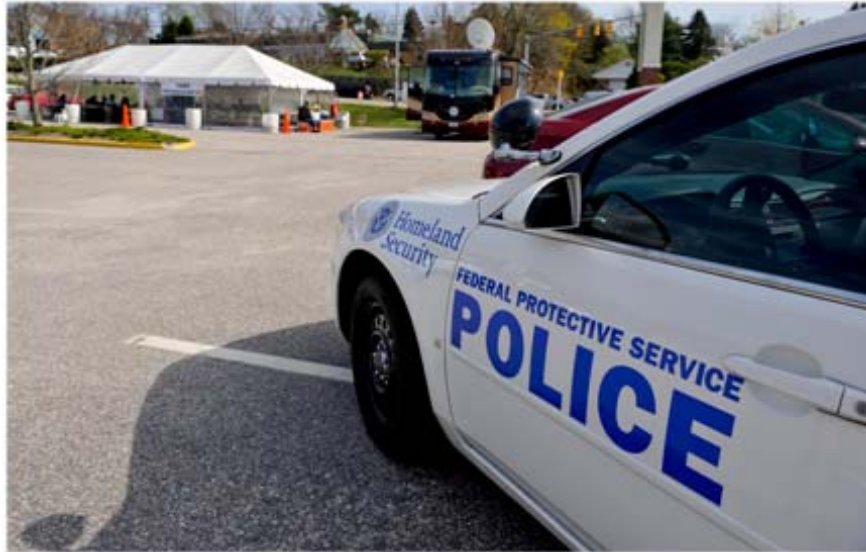
Figure 4 - Law enforcement agencies assisting with flood response in South Kingston, Rhode Island