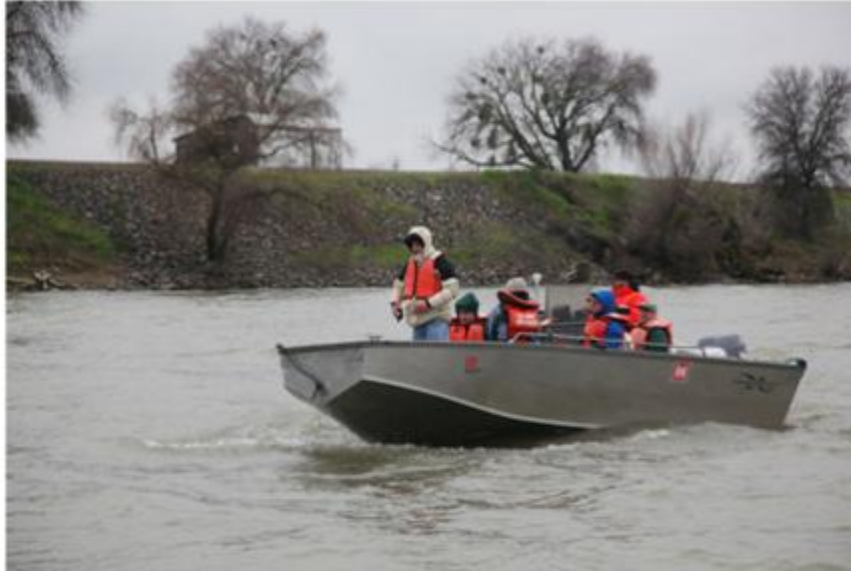
Figure 2 - Levee inspection by boat