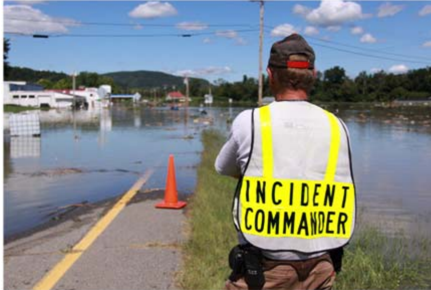
Figure 8 - Incident Commander observes damage caused by flooding in Westminister, Vermont