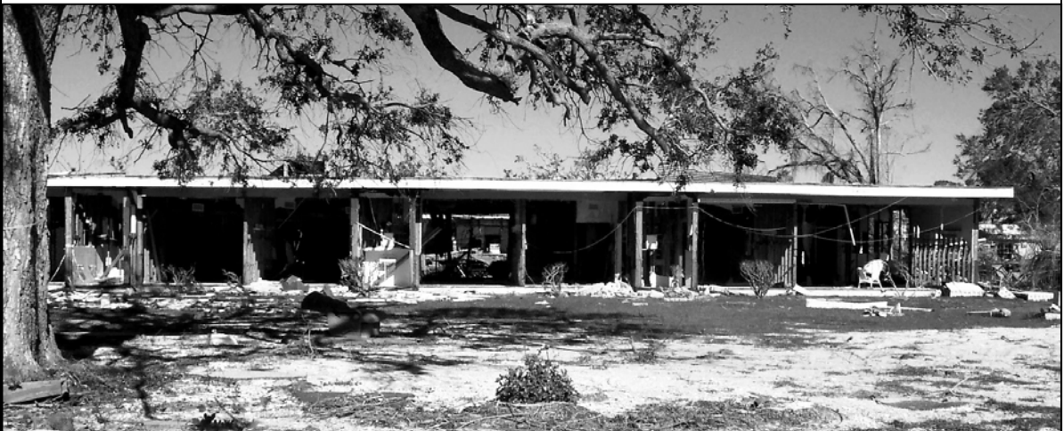
Figure 1. Photo of Destroyed Selected Nursing Home in Mississippi