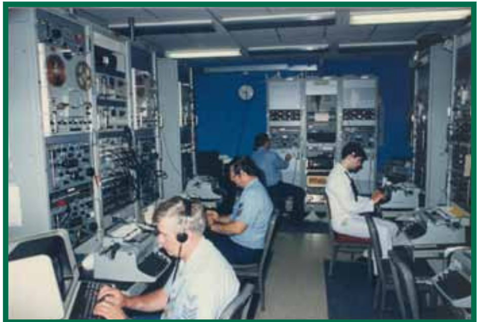
NSGR training suite

In addition to training, which was in the hands of the small group of experienced personnel known as "cadre" in most units, much reservist time was spent on recruiting and screening new members. The NSGR received a regular influx of personnel coming off active duty, yet it is evident that by the late 1950s the program had drifted from its operational aspirations and was becoming mired in routine, with too much training and administrative work and not enough real-world activities. Few reservists were assigned any specific wartime mission. The large-scale growth in the active duty Naval Security Group during this period was not