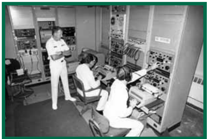
Naval Reserve chief petty officer supervises training of R-390 operators.

Vietnam had highlighted glaring COMSEC problems in all the armed services, so the program’s effort to increase COMSEC effectiveness for the active Navy was well timed. Some 1966 experiments conducted by several NSGR units to assess the possibilities offered by the COMSEC monitoring mission led to formal plans of action. In March