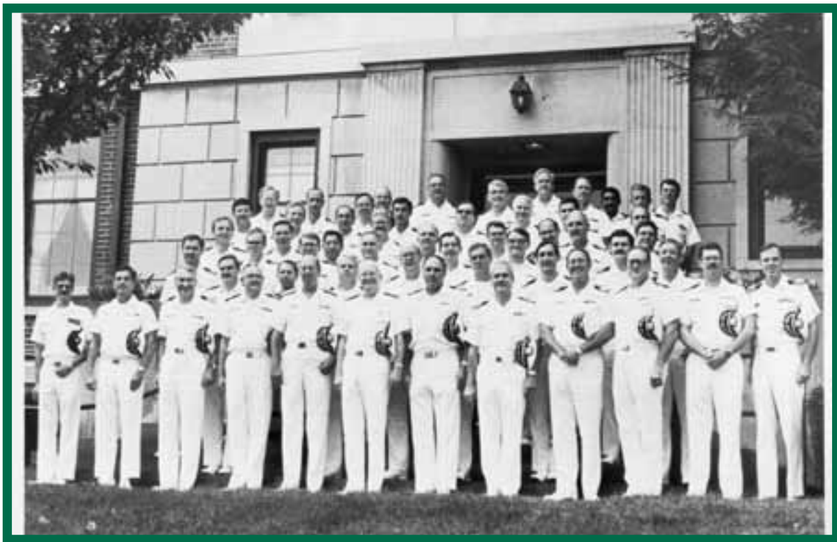
Naval Reserve Security Group leaders from around the nation attended the innovative 1986 Planning Conference in the historic building where Navy cryptologists helped win World War II.