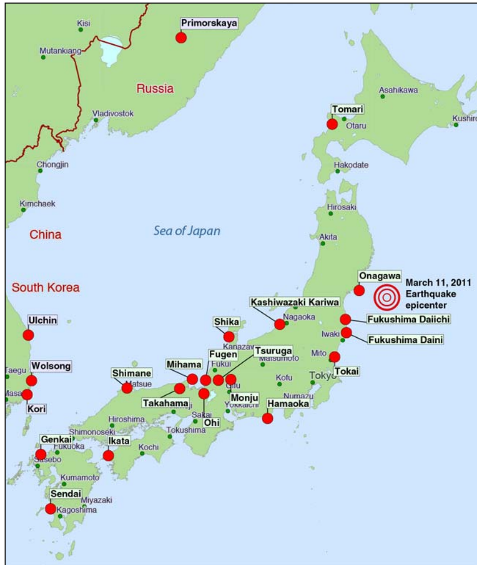
Figure 1. Japan Earthquake Epicenter and Nuclear Plant Locations