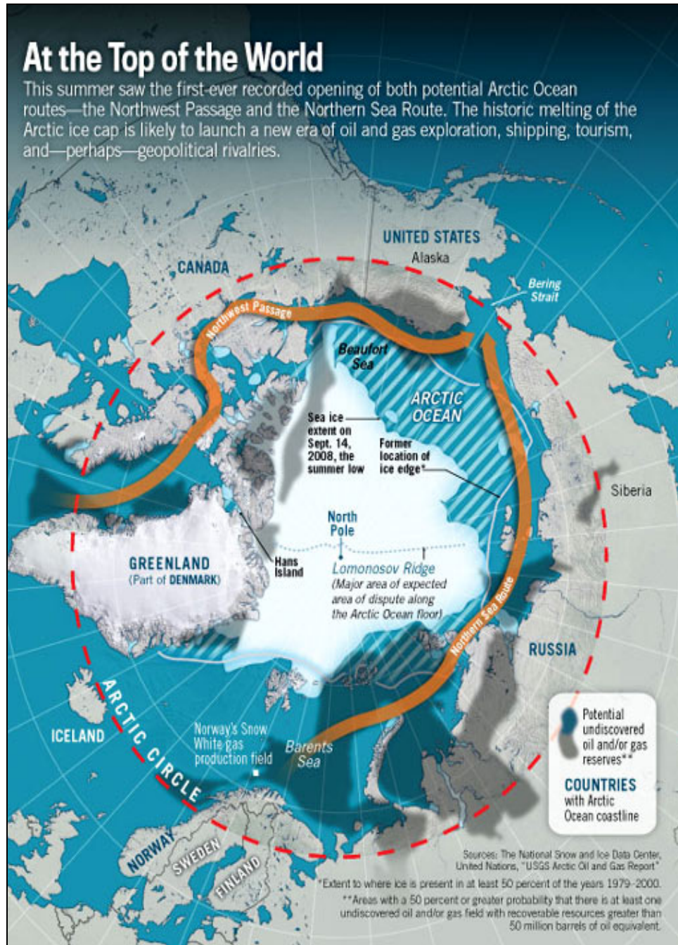
Figure 1. Arctic Sea Ice Extent in September 2008, Compared with Prospective Shipping Routes and Oil and Gas Resources

Source: Graphic by Stephen Rountree at U.S. News and World Report , http://www.usnews.com/articles/news/world/2008/10/09/global-warming-triggers-an-international-race-for-the-arctic/photos/#1 .