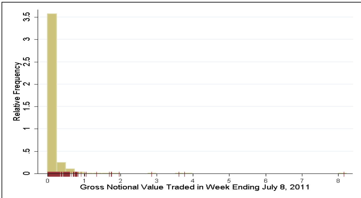
Figure 3. Distribution of Gross Notional Value ($ Equivalent, billions) Trading on Single Name Reference Entities As Reported to DTCC

Notes: Width of histogram bars is 10 contracts. Each short vertical line under histogram represents one reference entity.