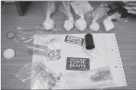
Seizing drugs that have been stashed in public places near a market can help drive out dealers and eventually close the market.

Monroe County Sheriff's Office at www.keyss.net