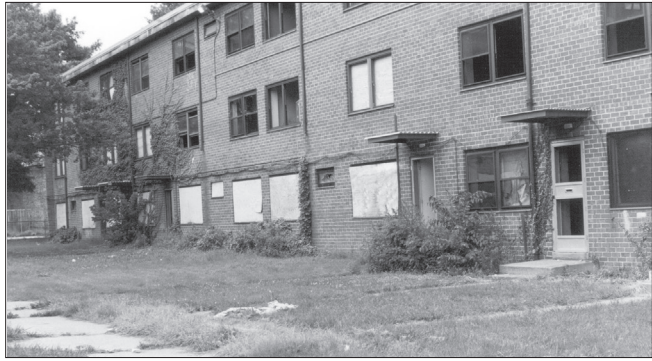
Urban areas with poorly-maintained, high-density low-income housing are often the site of open-air drug markets.

The location of an open-air drug market can also be influenced by situational factors. The local environment can facilitate drug dealing in a number of different ways. Thick or overgrown foliage offers a shield for exchanges of money or drugs. Poor street lighting may intensify residents' fear of crime and may exacerbate incidences of robbery. Street layout determines suitable places to stand so sellers can watch for the police as well as providing easy escape routes in case of enforcement activity. Road systems and parking may also influence customers driving in from other areas; and vacant buildings can serve as a discrete place to use drugs after purchase. 14