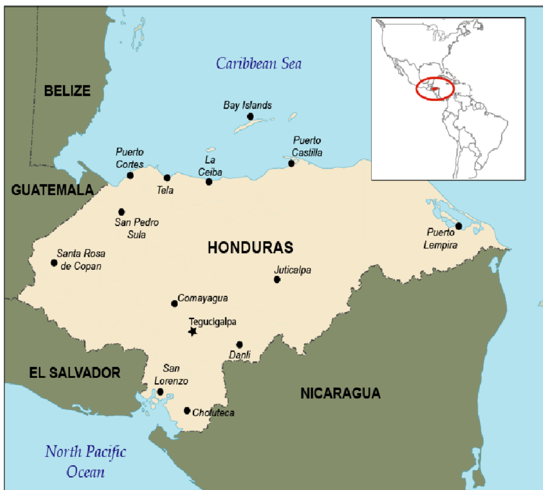
Figure 1. Map of Honduras