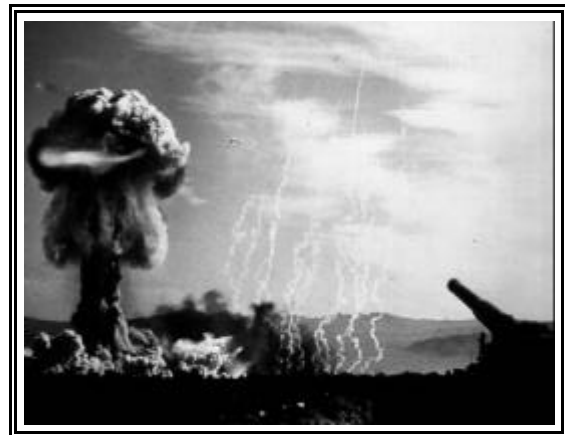
Grable was fired from a 280mm gun on May 25, 1953 at the Nevada Test Site. It was an airburst, weapons related test that produced a yield of 15 kilotons.