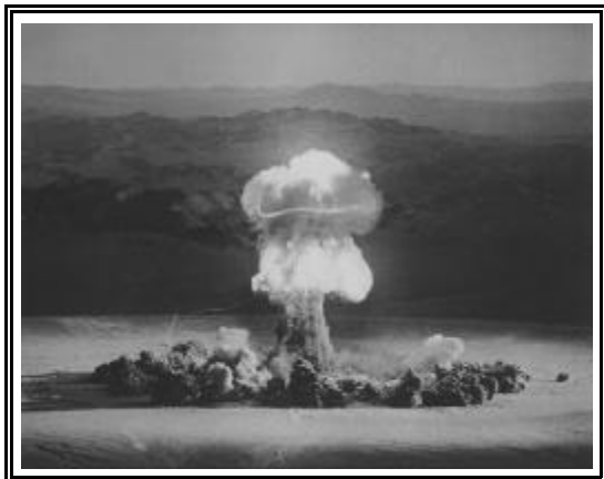
Priscilla was detonated on June 24, 1957 at the Nevada Test Site. It was a balloon, weapons related test that produced a yield of 37 kilotons.