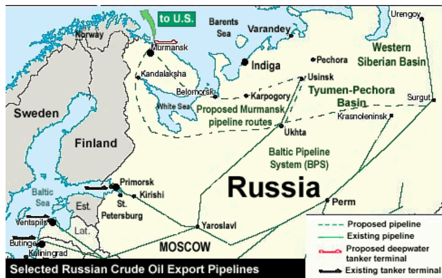
Figure 3. Selected Northwestern Oil Pipelines