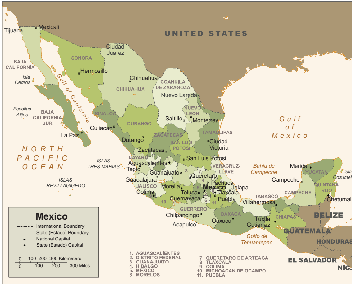
Figure 1. Map of Mexico