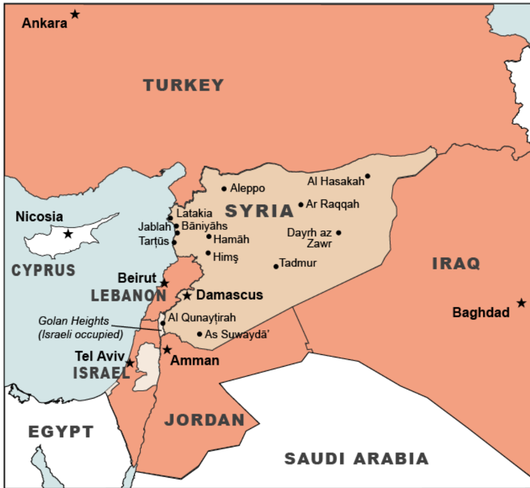
Figure 2. Map of Syria