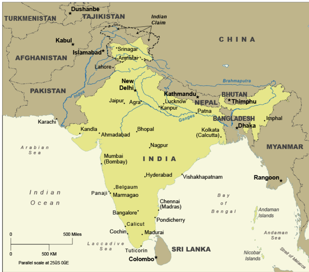
Figure 2. Map of India

Source: Map Resources. Adapted by CRS. (2/2007)