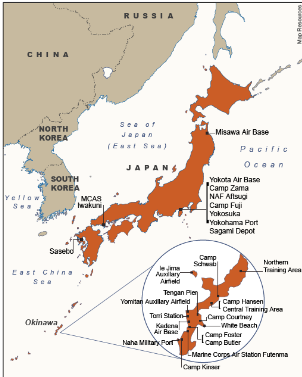
Figure 1. Map of U.S. Military Facilities in Japan