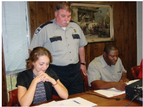
Figure 3 – Annual Training

competencies for their expected duties. Refresher training may be given in segments throughout the year so long as the required refresher training has been completed by the employee's training anniversary date. Time spent by security personnel critiquing or reviewing incidents may also be credited toward their annual refresher training requirements.