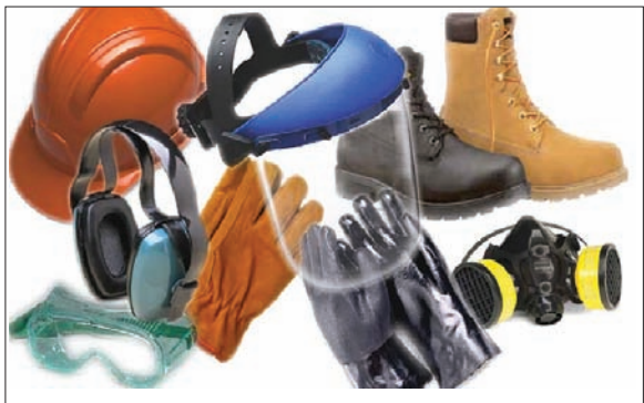
Figure 4 – Personal Protective Equipment

Where security personnel's assigned roles include closer approach to the release area or involve potential exposures, the hazard assessment and selection of PPE must account for the higher level of potential exposures.