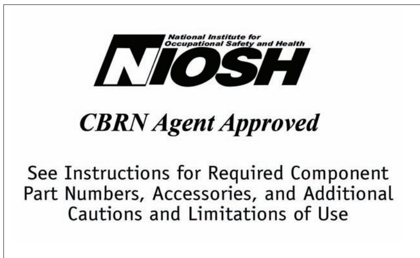
Figure 8 – NIOSH CBRN Agent Approval Label