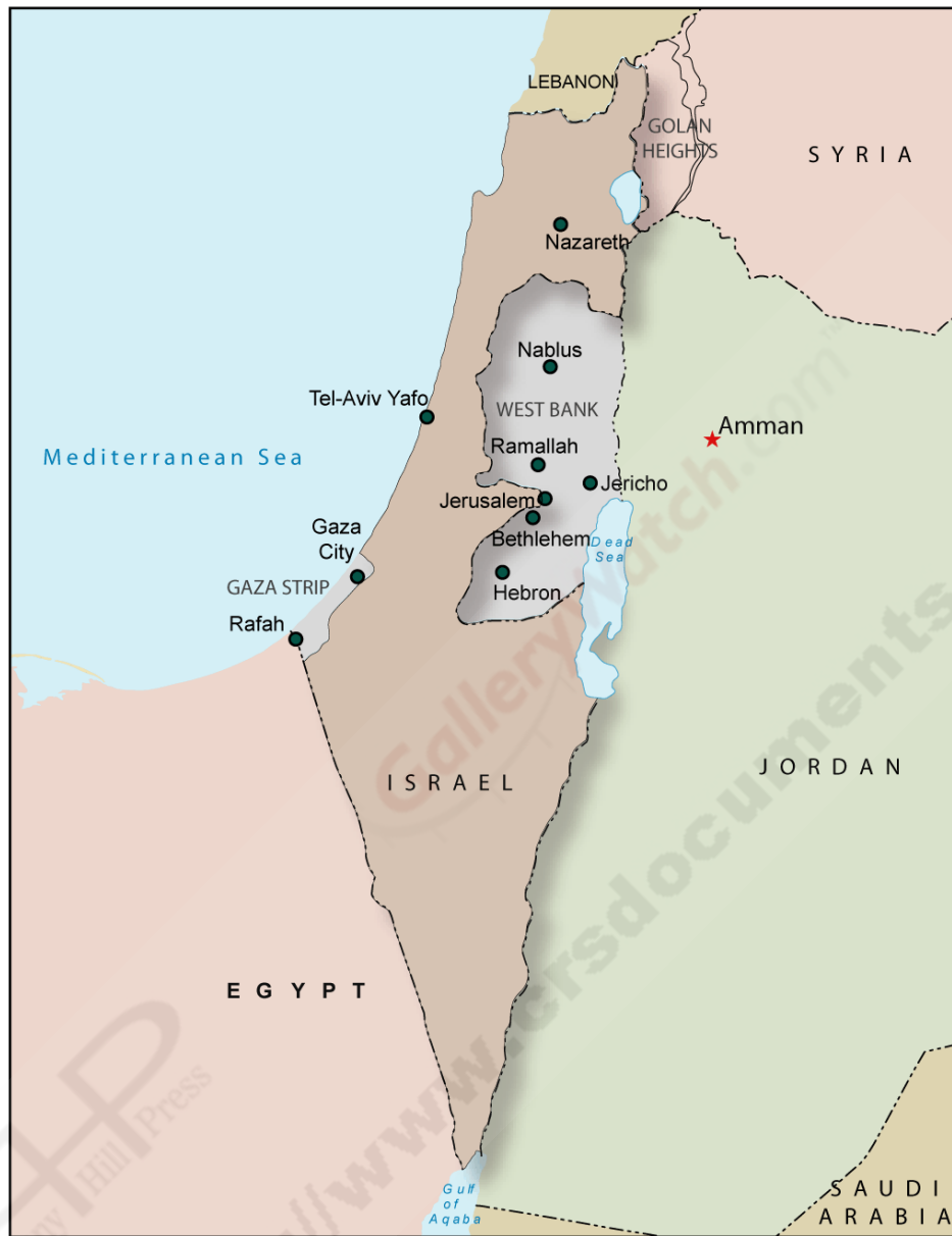
Figure 1. Map of West Bank and Gaza Strip