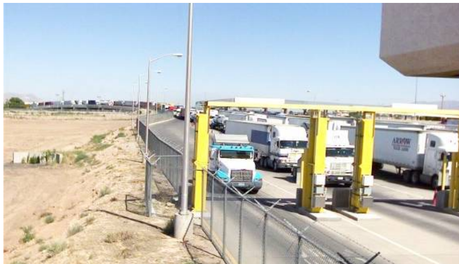
Trucks at the El Paso/Ysleta, Texas border crossing (June 2007, OIG)

After our visits, FMCSA and CBP agreed to develop a plan to check every truck every time, but, as of July 2007, no coordinated, site-specific plans to carry out such checks were in place. FMCSA stated that it would have plans outlined by August 22, 2007, but we have not received any outlines or completed plans. In our opinion, not having site-specific plans developed and in place prior to initiating the demonstration project will increase the risk that project participants will be able to avoid the required checks. Site-specific plans should ensure coordination among FMCSA, CBP, and state officials. Additionally, these plans should include quality control measures to ensure that FMCSA's system for checking each demonstration project truck is effective.