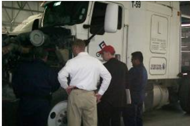
PASA at Carrier's Facility in Ciudad Juarez, Mexico (July 2007,)

During the safety audit, we observed FMCSA efforts to verify data provided by the Mexican carriers using other available information. For example, FMCSA officials conducting the PASA: