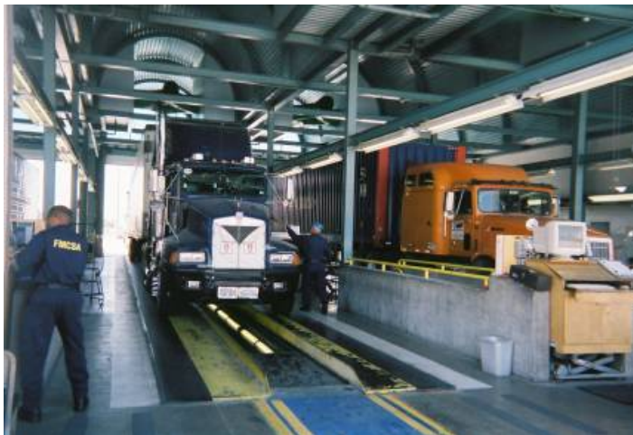
Figure 3. Inspection Facility in Otay Mesa, California

Given our prior audit work regarding the monitoring and enforcement mechanisms FMCSA already had in place before the announcement of the demonstration project, we focused our current work on determining whether FMCSA had implemented the specific provisions of the demonstration project. As discussed in the “Issues” section of this report (see page 1), we found that FMCSA has not developed sufficient plans for checking every demonstration project truck every time and has not done enough to ensure that state enforcement officials understand demonstration project guidance.