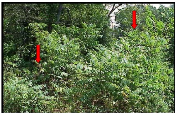
Highway Users' View Before Clearing Vegetation