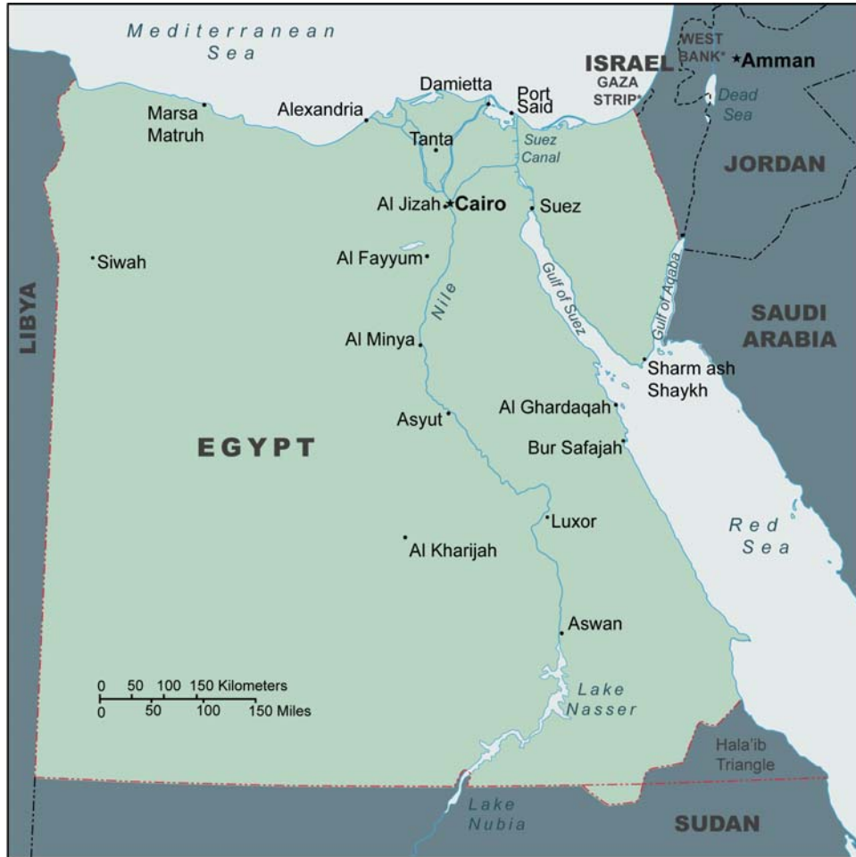
Figure 1. Map of Egypt