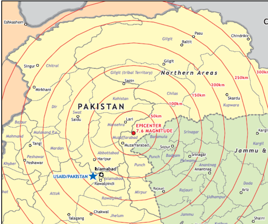
Map 2. The Epicenter and Political Boundaries