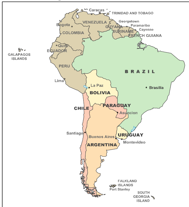
Figure 4. South America