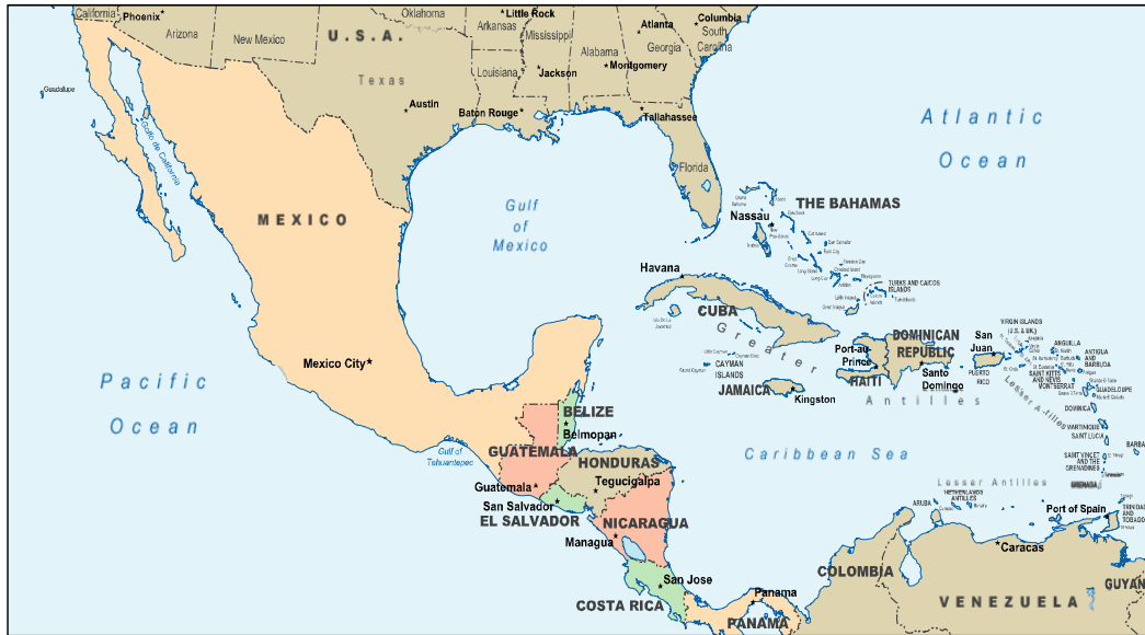
Figure 5. Mexico and Central America