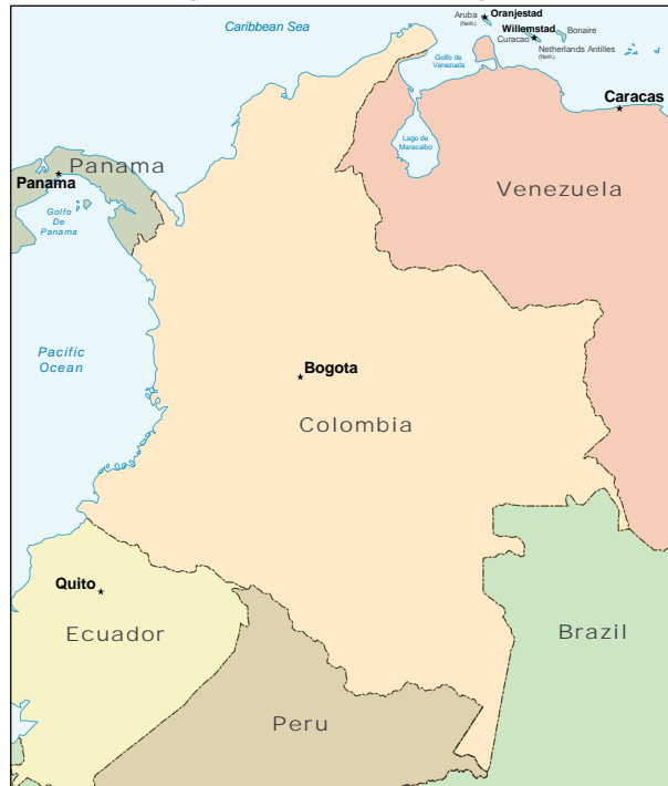
Figure 3. The Andean Region