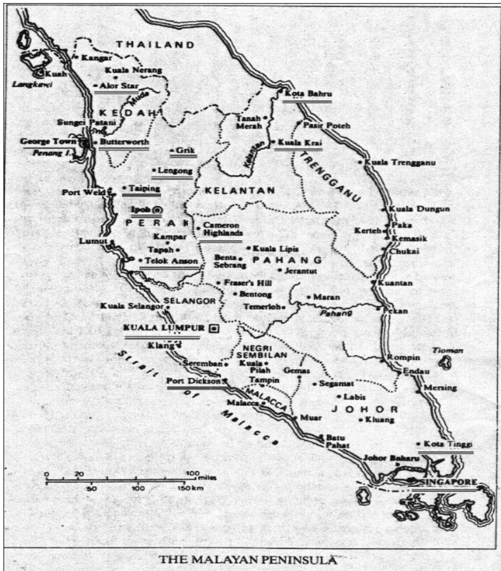
Table 1. Map of Malayan Peninsula during period of Malayan Emergencies.

thousands of people from jungle areas where they were vulnerable to guerrilla intimidation to the relative security of new villages. Britain also prepared the local people for independence, which was granted in August 1957 when Malaya became Malaysia. By 1960, the 1 st Emergency was practically over and, indeed, the Malaysian government declared the end of the Emergency in July, 1960. The remnants of the once formidable communist forces remained mostly in secluded areas near the border with Thailand. 2