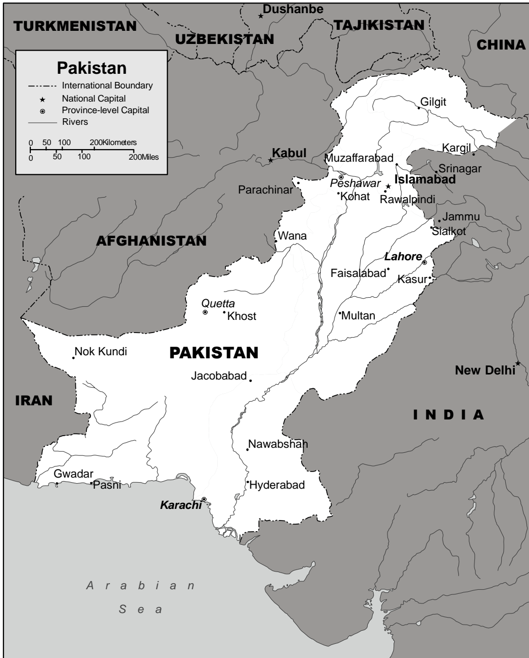
Figure 3. Map of Pakistan

Source: Map Resources. Adapted by CRS. (K.Yancey 11/12/04)