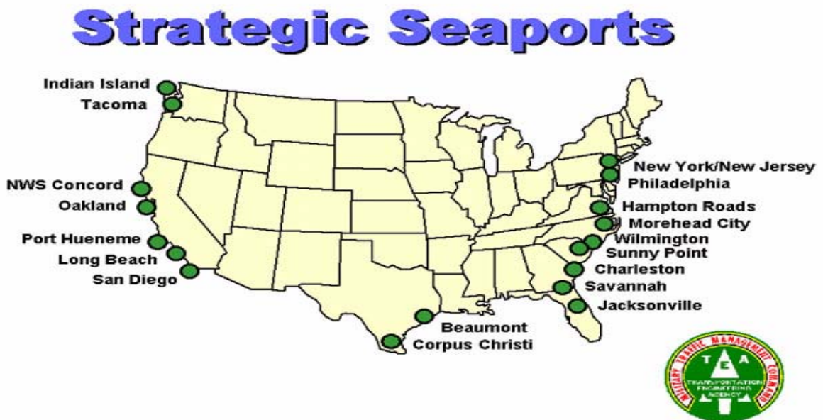
Figure 6. Strategic U.S. Seaports (January 2003).

There are currently 18 designated strategic seaports, four of which are DoD facilities primarily used for movement of arms, ammunition, and explosives. The four DoD strategic seaports are the Military Ocean Terminal Sunny Point, NC; the Military Ocean Terminal Concord, CA; the Indian Island Naval Magazine, WA; and the Naval Base Ventura County, Port Hueneme, CA. It is through these strategic seaports that DoD shipments, in ISO maritime shipping containers, are controlled, monitored, and tracked. (See Figure 6)