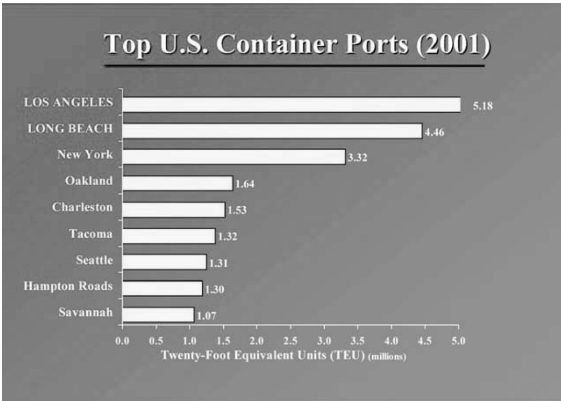
Figure 2. Top U.S. Container Ports and Volume of Maritime Shipping Containers (2001).

The 21 st century will see a renewed focus on intermodal freight transportation driven by the changing requirements of global supply chains. Each of the transportation modes (air, inland, water, ocean, pipeline, rail, and road) has gone through technological evolution and has functioned separately under a modally based regulatory structure for most of the 20 th century. With the development of containerization in the mid-1900s, the reorientation toward deregulation near the end of the century, and a new focus on logistics and global supply chain requirements, the stage is set for continued intermodal transportation growth.