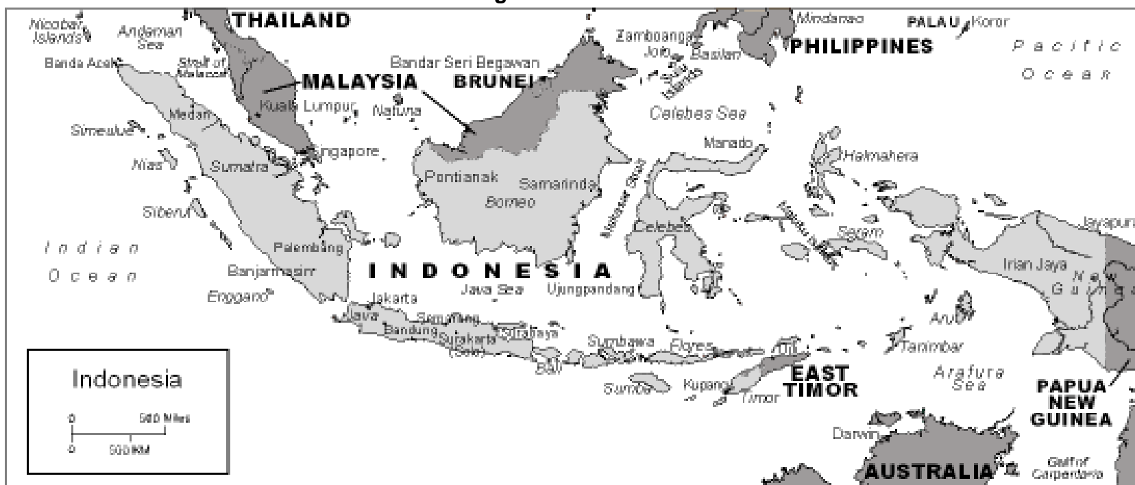
Figure 2. Indonesia