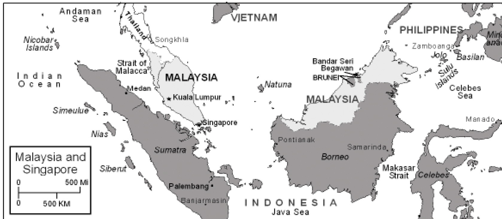
Figure 3. Malaysia and Singapore