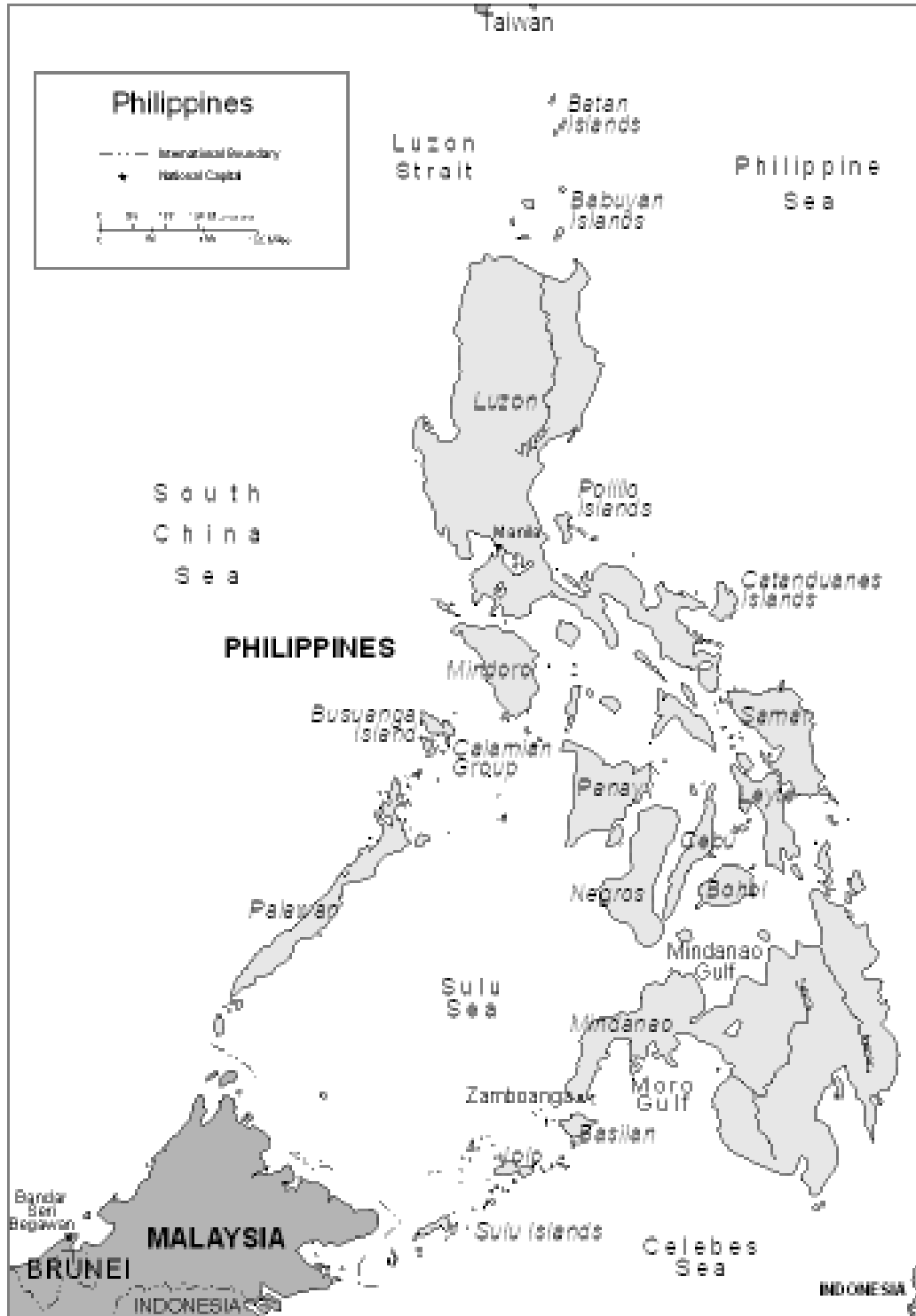
Figure 4. The Philippines