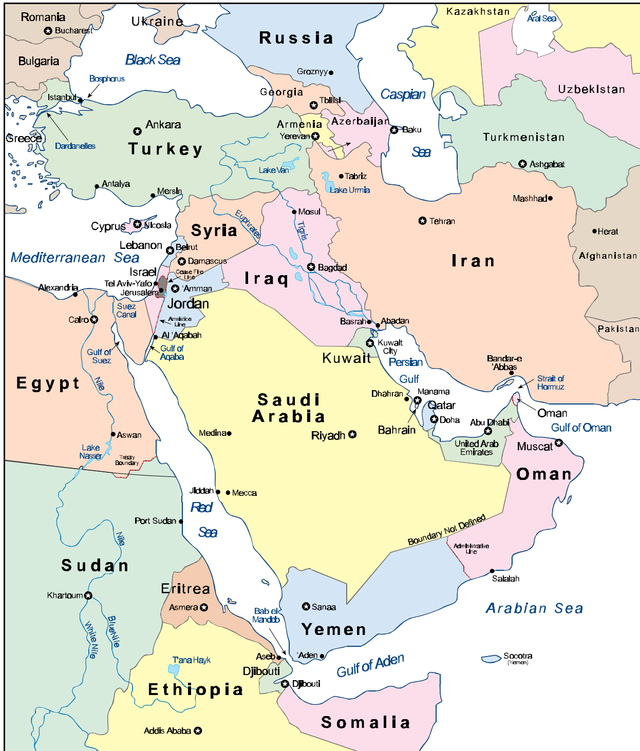
Adapted by CRS from Magellan Geographix. Used with permission.