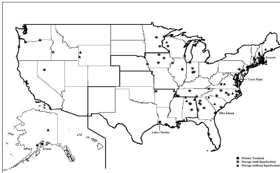
Figure 2: LNG Storage Sites in Utilities and Marine Terminals