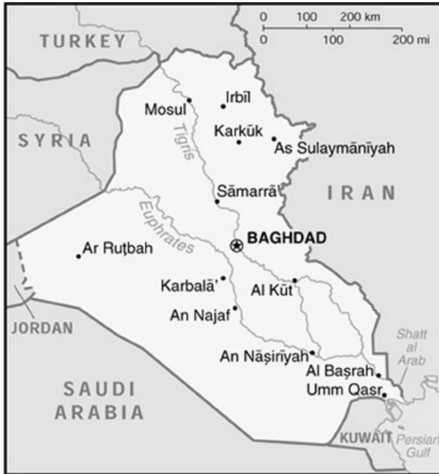
Figure 1. Map of Iraq

for medical purposes, and, in humanitarian circumstances, foodstuff” were excluded from the sanctions. 12 At the same time all Iraqi assets abroad were frozen.