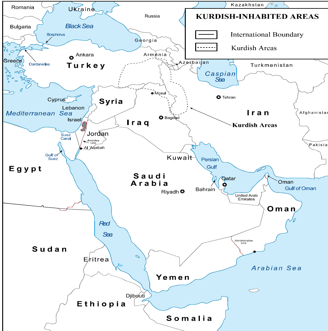
Figure 2. Kurdish-Inhabited Areas

Adapted by CRS from Magellan Geographix. Used with permission.