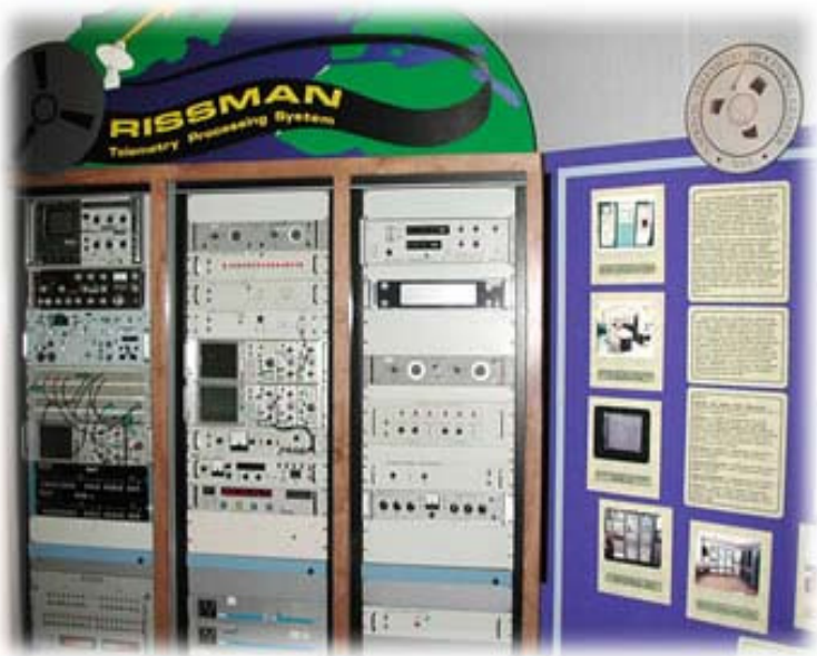
RISSMAN, a special-purpose telemetry processor

Different types of equipment sets were needed to process and analyze different forms of telemetry used by various telemetry transmission equipment. One example is RISSMAN, a special-purpose telemetry processing system used at NSA during the Cold War.