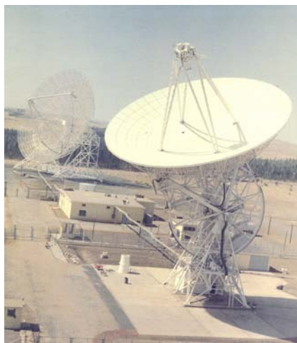
Now-closed STONEHOUSE deep space TELINT facility

In 1960, two major overseas ELINT processing centers became integral parts of the overall DoD ELINT structure NSA developed. These centers processed and analyzed data primarily from the US military departments' ELINT collection assets. In 1974 the USAF Europe sponsored programs with NATO partners and was fully integrated into the NSA system. Later this effort was combined with the NSA engineering support office in Europe.