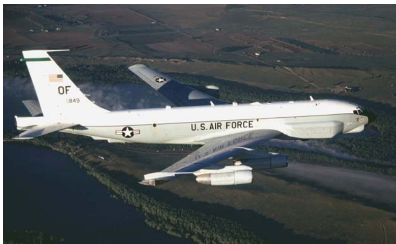
Modified RC-135U advanced ELINT airborne collection platform

TechELINT specially configured aircraft is ELINT reconnaissance and surveillance. They collect, analyze, and sometimes locate foreign target electronic signals to help determine detailed operating characteristics and capabilities. They have been in operation, with a continuing series of advanced configurations, since 1964.