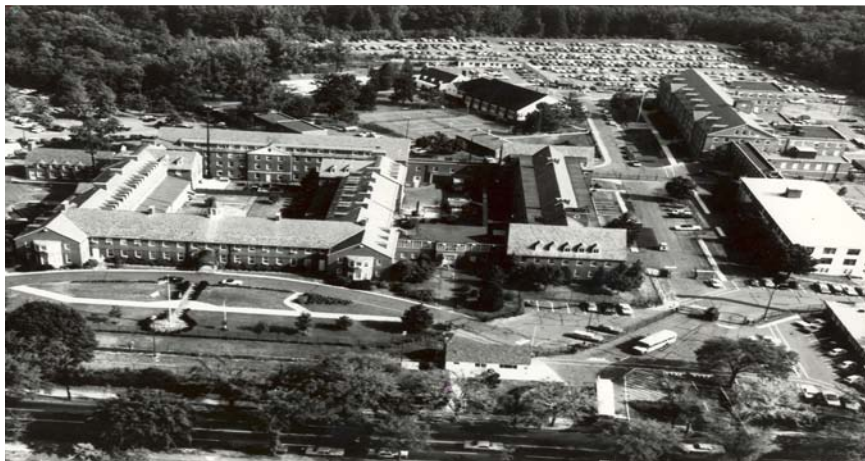
Naval Security Station (NSS) at Nebraska Avenue in Washington, DC, home of the NTPC

AFCIN-Z; it was housed in Building 20 at the Naval Security Station in Washington, DC. In addition to Army and Navy participation, the NTPC had key participants from the USAF and from the CIA. CIA at that time was operating the U-2 airborne reconnaissance program, and it led the integration of U-2 data into NTPC signal processing efforts. The U-2 had ELINT signal collection packages as well as photographic sensors.