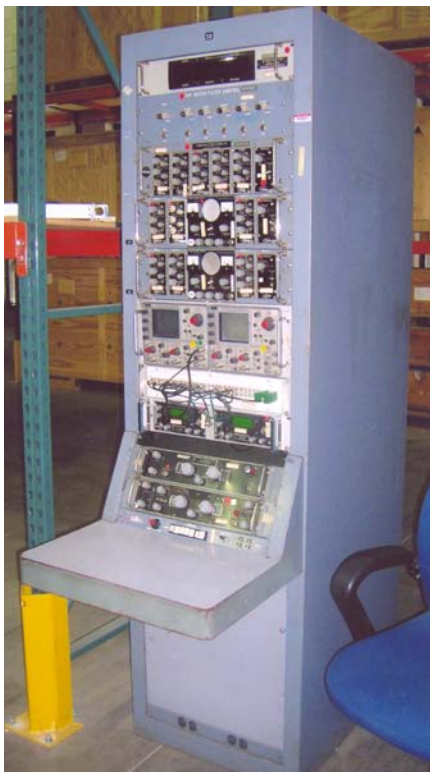
TELINT signal collection position in early 1970s

National Security Council Intelligence Directive No.6 was updated in 1972 and retitled “Signals Intelligence (SIGINT).” This directive gave NSA even more ELINT powers. Based on NSCID 6 concepts, SIGINT within DoD had been implemented by Department of Defense Directive 5100.20, issued in 1971 and commonly referred to as the “NSA Charter.” The DoD Directive charged NSA with the responsibility of managing SIGINT within DoD and specifically defined SIGINT as including COMINT, ELINT, and TELINT. As previously mentioned, the term TELINT has fallen into disuse and has been replaced by the term FISINT, which includes telemetry, missile and satellite command signals, and beacons.