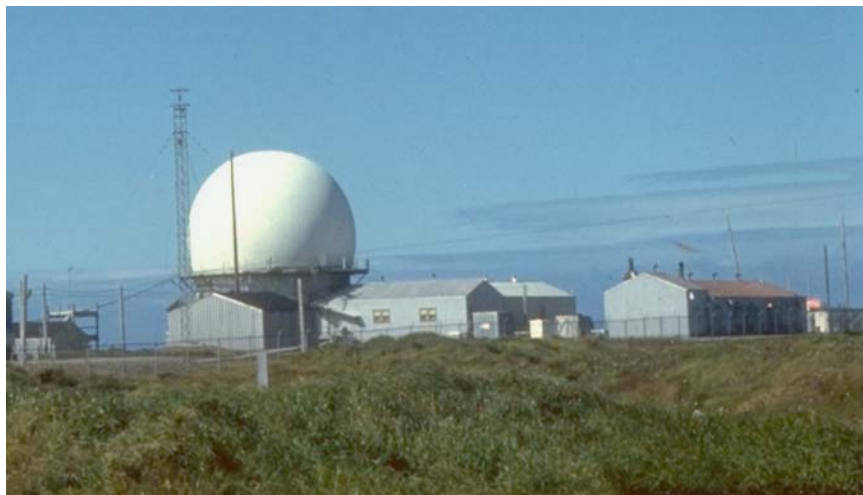
Now-closed 1970s missile and space TELINT facility

TechELINT specially configured aircraft is ELINT reconnaissance and surveillance. They collect, analyze, and sometimes locate foreign target electronic signals to help determine detailed operating characteristics and capabilities. They have been in operation, with a continuing series of advanced configurations, since 1964.