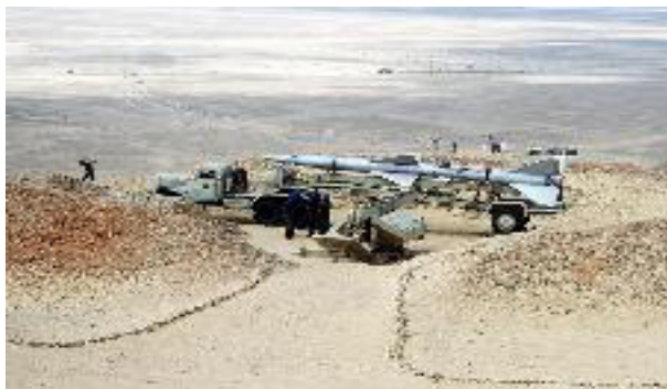
SA-2 “Guideline” ground-to-air missile system

and its reporting responsibilities to NRO activities, provided many collection and processing advantages, and improved timely reporting of NRO collection results.