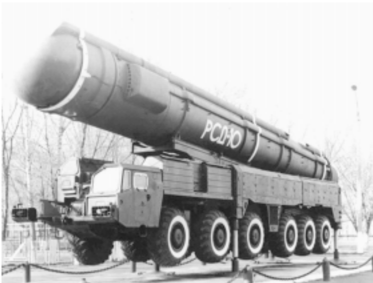
Volkinsk Plant State Production Association