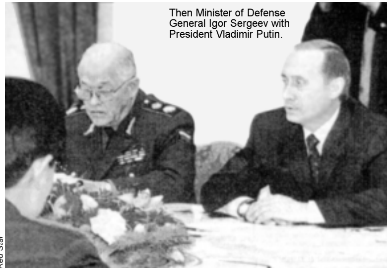
Then Minister of Defense General Igor Sergeev with President Vladimir Putin.

Further development of US deep-strike precision systems risks the security and stability of Russia’s strategic nuclear forces. One Russian response would be investing in precision, long-range, non-nuclear weapons to prevent nuclear weapons use, increase effectiveness of deterrence and perform important missions in local conflicts. 34 Budgetary constraints might force Russia to rely temporarily