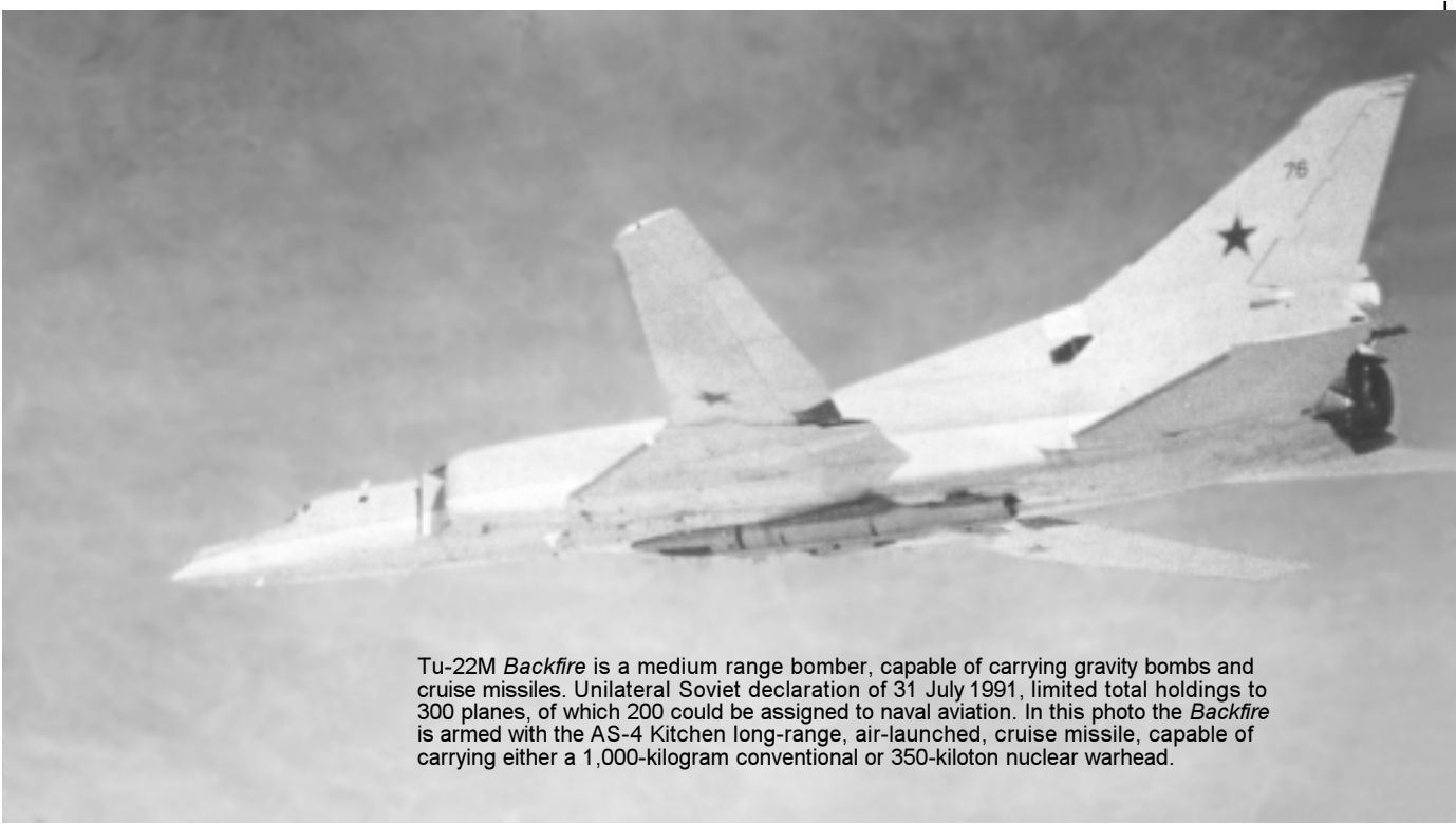
Tu-22M Backfire is a medium range bomber, capable of carrying gravity bombs and cruise missiles. Unilateral Soviet declaration of 31 July 1991, limited total holdings to 300 planes, of which 200 could be assigned to naval aviation. In this photo the Backfire is armed with the AS-4 Kitchen long-range, air-launched, cruise missile, capable of carrying either a 1,000-kilogram conventional or 350-kiloton nuclear warhead.

Strategic nuclear forces remain the main means of deterrence, but the presence of nonstrategic nuclear weapons offers a chance (although fragile) to prevent the avalanche-like transformation of a regional conflict into an unlimited global use of nuclear weapons. In these circumstances, nonstrategic nuclear weapons can be employed to destroy military targets in the region. However, if the enemy does not halt aggression, then the target set shifts to “counter-value targets to be attacked by long-range aviation of strategic nuclear forces.”