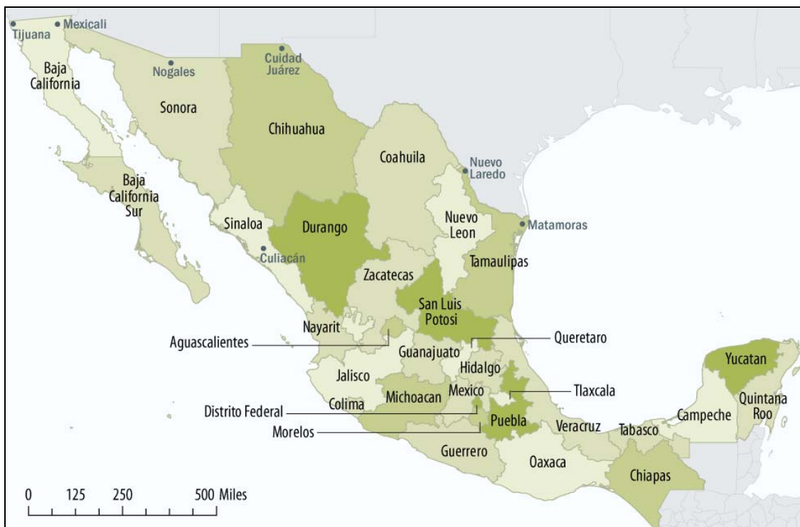
Figure 2. Map of Mexico