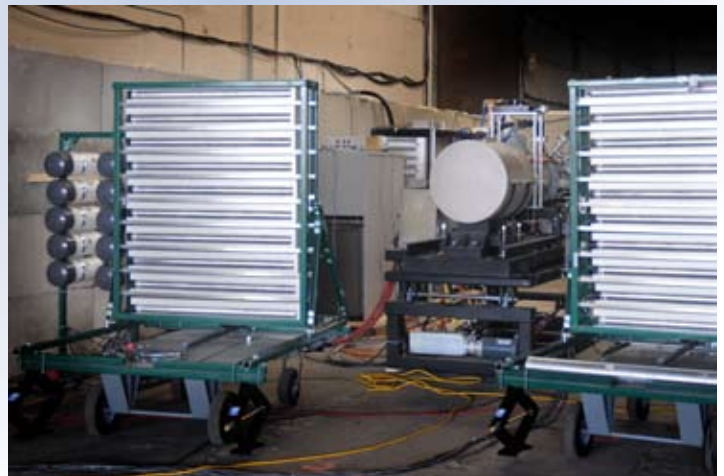
The PITAS system was developed for the Defense Threat Reduction Agency by INL and Idaho State University engineers.