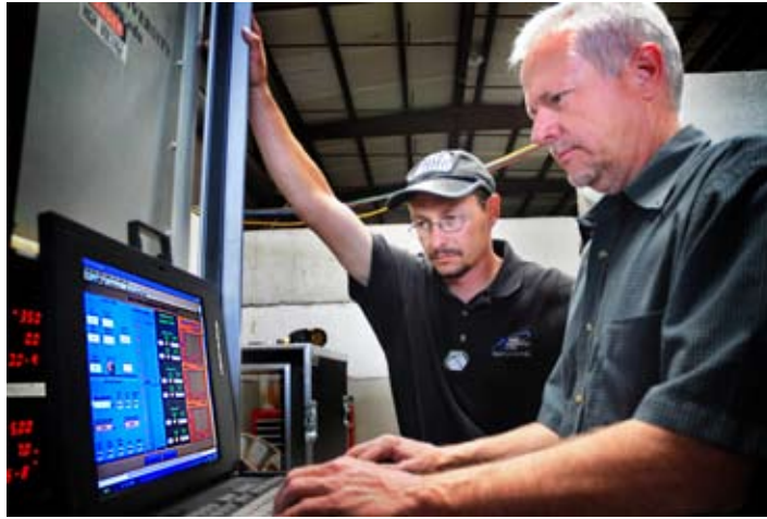
The complete PITAS system includes a linear accelerator, collimator, hydraulic platform and a series of neutron and gamma detectors all operated by remote control

Once the electrons are inside the collimator they are converted into high-energy x-rays. Excess neutrons and absorbed by the collimator which results in a bremsstrahlung radiation process similar to a dental x-ray. Then, the collimator forces the energy beam through a small opening in the direction of the cargo container.