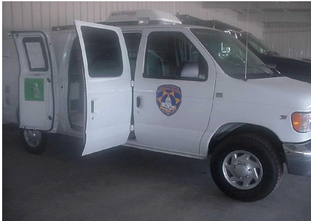
Figure 1. MALS

Mobile Analytical Laboratory System. The MALS design does not adequately accommodate the mission need. According to CoMPIO officials, the MALS was intended to be a platform for currently fielded lab equipment as well as emerging technology. The platform that was chosen, however, does not provide adequate physical space for the currently designated components or laboratory operations conducted by two people wearing chemical protective gear deemed necessary by the WMD-CST MALS operators. Discussions with officials from the organizations involved in developing the MALS that CoMPIO fielded revealed that engineering of the MALS was not adequately managed to produce a system capable of meeting mission requirements. Further, no analysis was conducted to compare the capabilities provided by the MALS with those of other existing military or commercial systems.