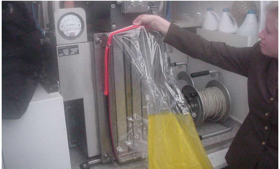
Figure 3. HEPA Filter