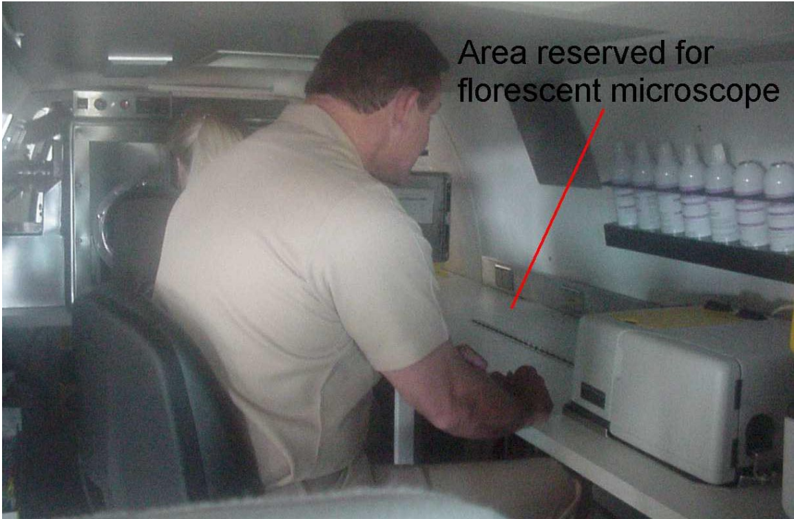
Figure 5. Space inside of the MALS with area reserved for florescent microscope labeled

The ELISA was identified by the U.S. Army Medical Research Institute of Infectious Diseases as the “gold standard” of identification technology for three biological agents on the high probability list. As of September 15, 2000, the biological detection and identification capability of the fielded MALS is limited to bio-immunoassay tickets [bio-tickets] produced by the Joint Program Office for Biological Defense. The Joint Program Office for Biological Defense has management responsibility for all DoD biological defense acquisition programs. According to officials at the West Desert Test Center at Dugway, experienced and trained personnel who teach courses on the proper use of bio-tickets had difficulty with the bio-tickets because of high rates of false positive and false negative readings. In their opinion, the requisite skills required to use the bio-tickets and obtain trusted results are perishable and require constant training. Without all the originally planned equipment in the MALS, such as ELISA, and training to operate it, the WMD-CSTs will not be able to provide timely and effective biological agent identification to incident commanders and will not be able to protect public health and safety.