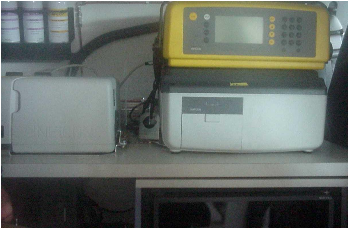
Figure 4. HAPSITE with copper tubing in background

MALS Portable HAPSITE. Operational issues affecting usefulness to the WMD-CSTs have been identified with the HAPSITE. 9 The MALS is equipped with a HAPSITE that consists of a headspace sampler and a gas chromatograph/mass spectrometer for field identification of organic compounds. One issue identified by the WMD-CSTs is that the HAPSITE does not heat the sample sufficiently to identify a vast number of compounds, especially heavier, persistent agents. An upgrade for the HAPSITE has been identified and purchased, and is supposed to correct the deficiencies. According to SBCCOM officials, they were not sure how effective the upgrade is because they have not been given the opportunity to test it. Additionally, some of the WMD-CSTs have identified that the HAPSITE is unreliable, noting a failure of the ion pump and that the system pressure reads too high. One WMD-CST repeatedly identified their HAPSITE as a deadlined Equipment Readiness Code A (ERC-A 10 ) item, inhibiting mission capability.