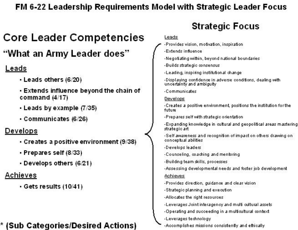
Figure 3 FM 6-22 Army Leadership Requirements Model with Strategic Leader Focus. 44

clarifies the requirements for strategic leaders. This chapter specifically defines the requirements for strategic leaders, using the same three core competencies of lead, develop and achieve. This list does not replace the comprehensive list provided earlier but clarifies the specific differences required of strategic leaders. (see figure 3)