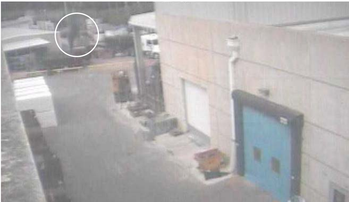
Figure 8. Security camera photograph of black plume coming from a cylinder on trailer in The Woodlands, Texas.

were standing on the ground at the back of the trailer near the trailer's block valve and attachment to the plant's discharge arm, but the focus of the camera was not adequate to show what they were doing. During postaccident interviews, both operators said that they had believed that they had completed the connection procedures and had pressurized the manifold. They told interviewers that after they had reviewed Western's standard operating procedures manual, however, they realized that they had not opened the block valve before pressurizing the manifold as Western's procedures required. Just after the accident, the trainee operator told a Hughes Christensen employee that the trailer had jumped as they opened the block valve. Shortly after that, the security camera recorded a black plume coming from one of the cylinders on the trailer. (See figure 8.) A similar reaction occurred on other cylinders on the trailer until the released gases ignited. Heat from the fire on the accident trailer caused the release of unreacted acetylene gas on an adjacent trailer.