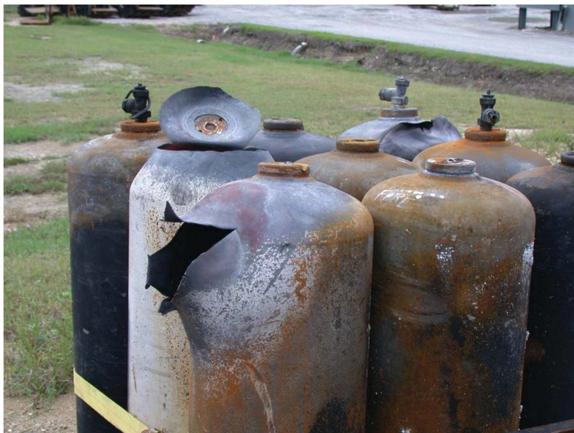
Figure 5. East New Orleans cylinder showing burst near head.