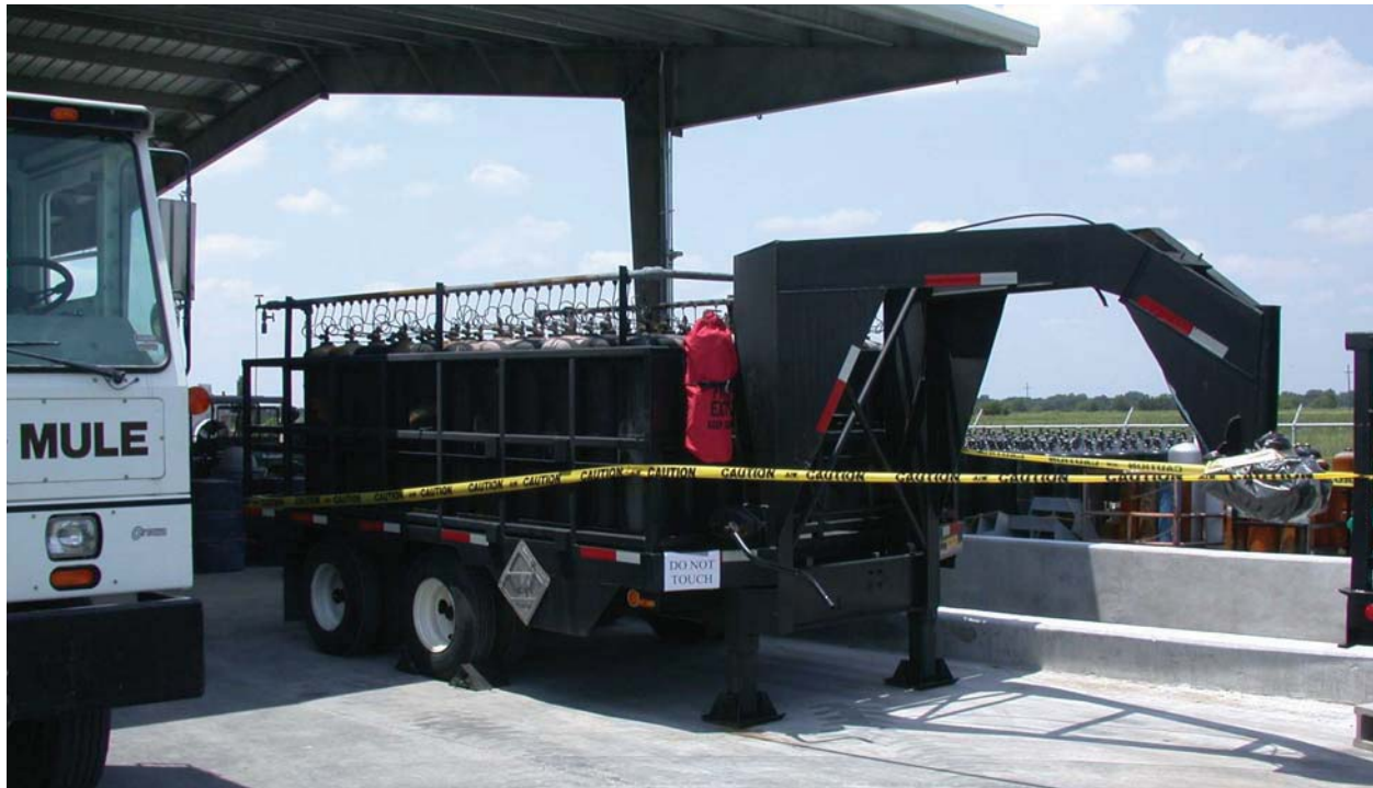
Figure 1. The Woodlands trailer (a small mobile acetylene trailer).

Figure 2 shows cylinders on a mobile acetylene trailer. The valve opening on each cylinder is connected by spiral tubing, called a pigtail, to the manifold that delivers or receives the acetylene gas to or from the cylinder. Attached to the manifold, on the back of the trailer, is a cargo transfer fitting, which is not visible in this photograph. This fitting is the connection between the trailer and the piping from the plant. The tubing and manifold piping are designed to contain the energy of an accidental decomposition reaction. A manual block valve (block valve) controls the flow of acetylene to and from the cargo transfer fitting. The piping includes an air-actuated valve that shuts off the flow if a trailer pulls away accidentally before it is disconnected. A needle valve on the manifold is used to reduce pressure on the manifold after cargo transfer and leak testing. Pressure gauges are mounted on the trailer: one on the manifold and one on the trailer piping between the block valve and the connection to the plant piping. According to Western, filling the cylinders through the manifold connection takes about 12 hours.