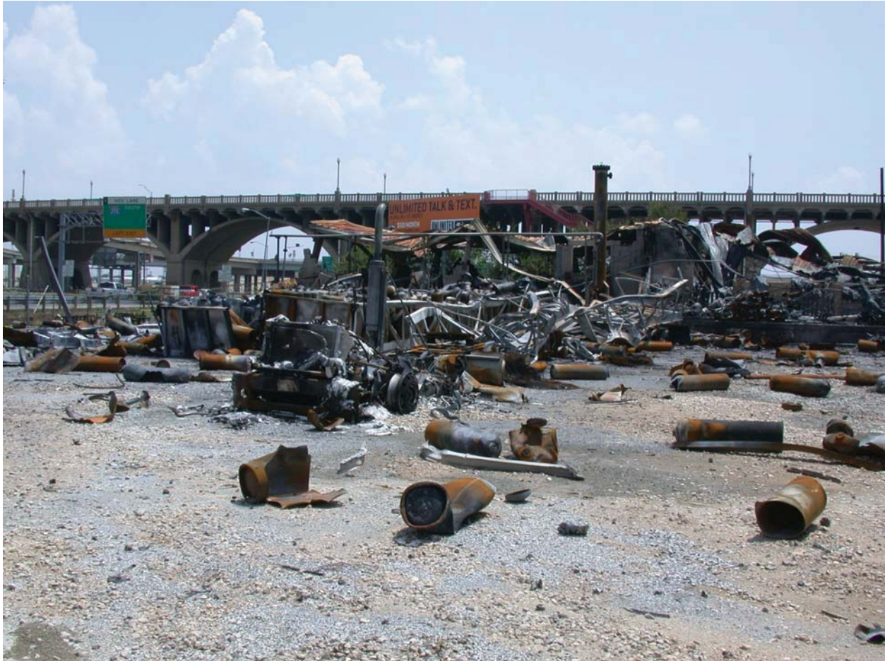
Figure 10. Dallas accident damage to Southwest facility and vehicles. (Accident trailer and cylinders in foreground.)

The accident trailer was filled and shipped from the BASF Corporation plant in Geismar, Louisiana. The capacity of the cylinders was approximately 100,000 standard cubic feet of acetylene. The operator typically worked in a two-person team that drove, loaded, and unloaded mobile acetylene trailers. The accident occurred during the operator's third delivery to Southwest, which was his first solo delivery to that location. He had made five solo deliveries to other facilities. The operator said that he had followed Western's standard operating procedures when he prepared the trailer for unloading at the Southwest facility. He said that after cycling the facility's discharge arm valve, leaving it closed (step 11 of Western's unloading procedures), he checked the pressure gauges on the manifold and both read 0 psig, which he did not identify as a problem. Step 4 of Western's unloading procedures requires that 50 psig of acetylene pressure remain in the manifold, and discussions with Western management revealed that at the completion of step 11 there should still have been slightly less than 50 psig pressure in the manifold.