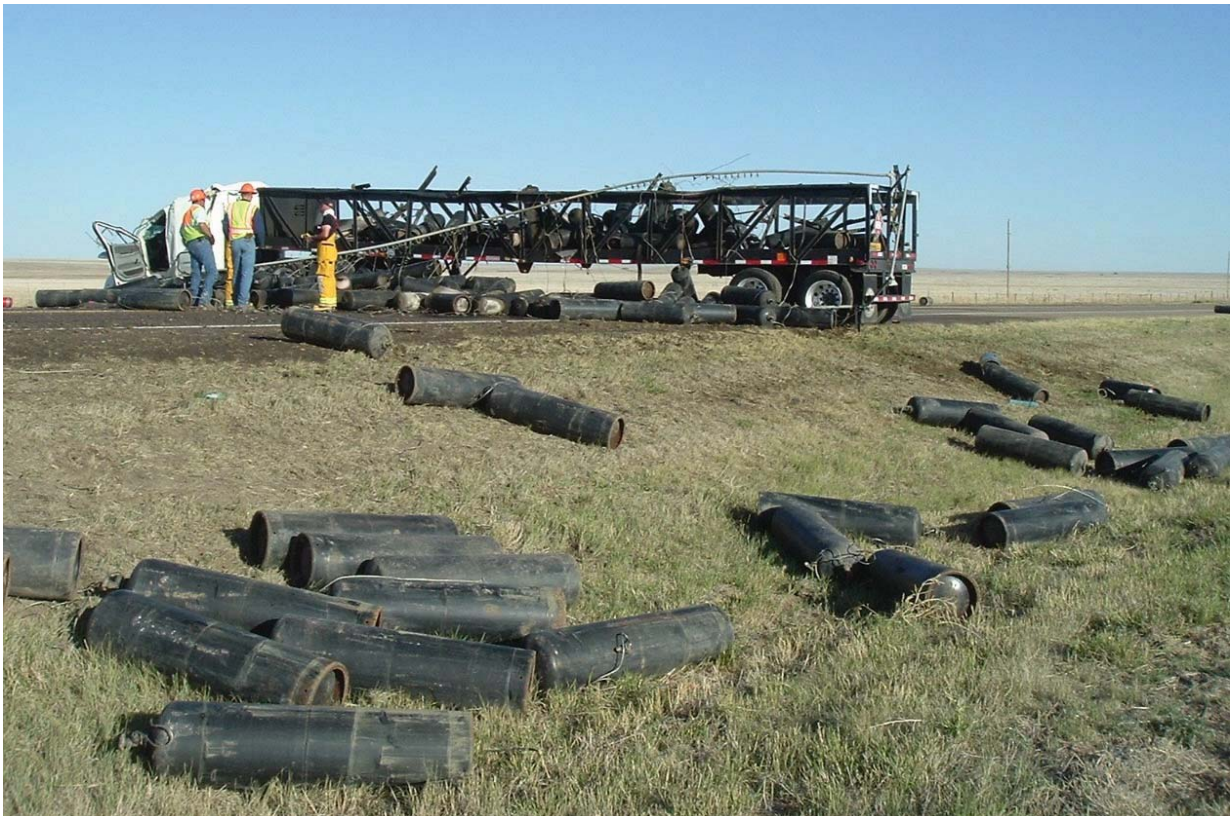
Figure 6. Lamar accident vehicle.

About 12:15 p.m. mountain daylight time on June 9, 2008, a southbound Western tractor and mobile acetylene trailer carrying 225 DOT 8AL specification cylinders (450 standard cubic feet capacity each) containing acetylene gas residue overturned on Highway 287 about 6.5 miles south of Lamar, Colorado. 12 As a result of the overturn, about half of the cylinders were thrown from the trailer, and acetylene gas from 86 of the 225 cylinders was released and ignited. (See figure 6.) The overturn damaged the tractor and the trailer. There was some fire damage on the trailer. There were no injuries from the accident. Property damage to the tractor and trailer totaled about $200,000.