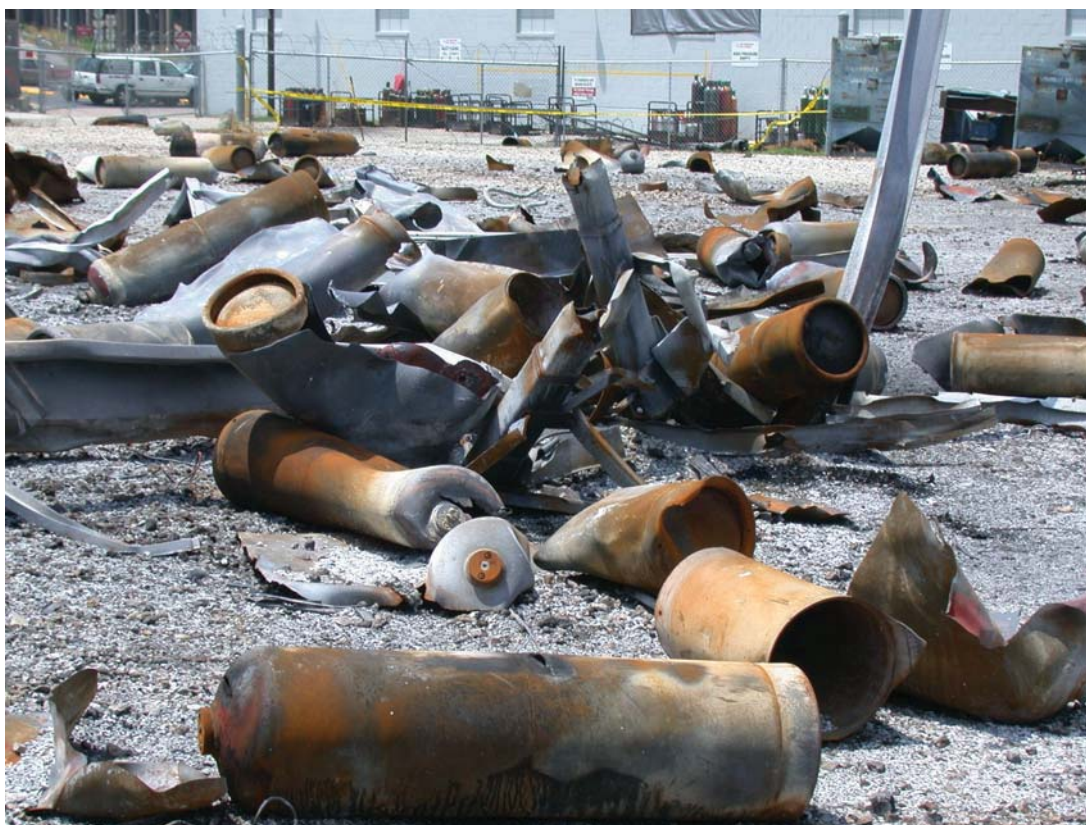
Figure 12. Dallas cylinder damage.