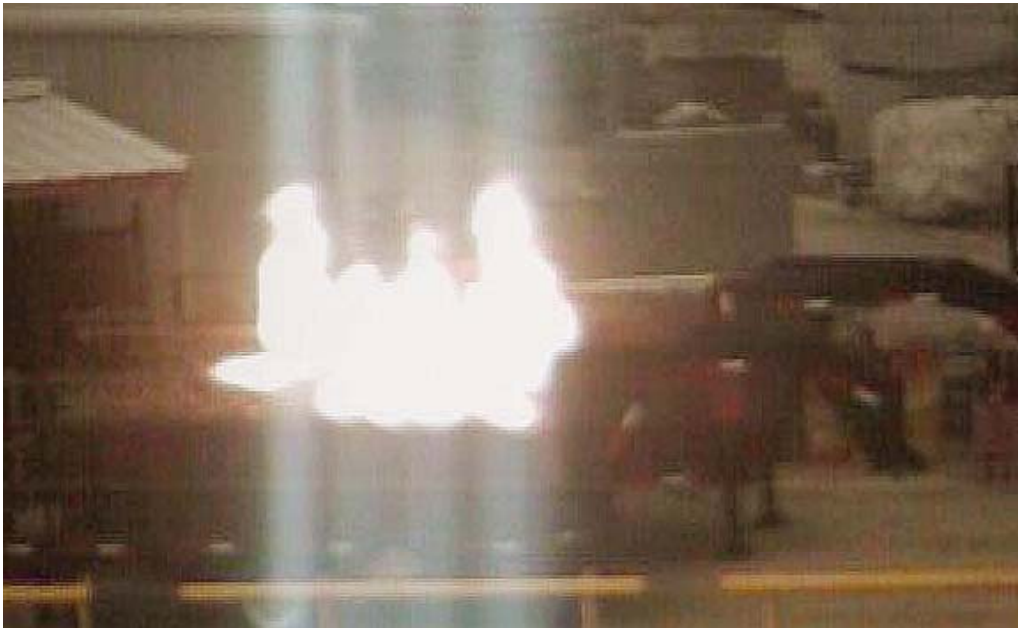
Figure 7. Security camera photograph of acetylene gas fire in The Woodlands, Texas.

About 2:55 p.m. on August 7, 2007, acetylene gas ignited on a Western mobile acetylene trailer containing 62 manifolded DOT 8AL specification cylinders (420 standard cubic feet capacity each) resulting in a fire on that trailer and an adjacent trailer at the Hughes Christensen plant in The Woodlands, Texas. (See figure 7.) The fire occurred as the operators were preparing the trailer to be unloaded. There were no injuries or fatalities. Property damage to the two trailers totaled $40,200.