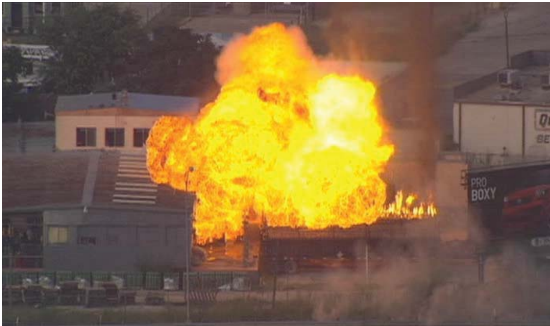
Figure 9. Acetylene gas fire at Southwest facility in Dallas.

About 9:50 a.m. on July 25, 2007, acetylene gas ignited on a Western mobile acetylene trailer containing 225 manifolded DOT 8AL specification cylinders (450 standard cubic feet capacity each) on the docks at the Southwest Industrial Gases (Southwest) facility in Dallas, Texas. (See figure 9.) The fire occurred as the operator was preparing the trailer to be unloaded. A video recording made by a Dallas television network did not record the initiation of this accident; however, it showed a gradual progression of the fire and explosions from the trailer on which the operator was working to adjacent trailers, to Southwest's building, and to vehicles parked in front, one of which contained acetylene-filled cylinders for delivery. The fire and explosions destroyed the Southwest facility and many vehicles, damaged several nearby buildings, and caused the failure of hundreds of acetylene-filled cylinders from three other Western acetylene trailers, 13 the delivery truck, and the facility's docks and storage. (See figure 10.) The operator sustained back injuries, and the plant manager and general manager were severely burned during the accident. There were no fatalities. Property damages have not been fully assessed, but Southwest estimated losses of more than $5 million.