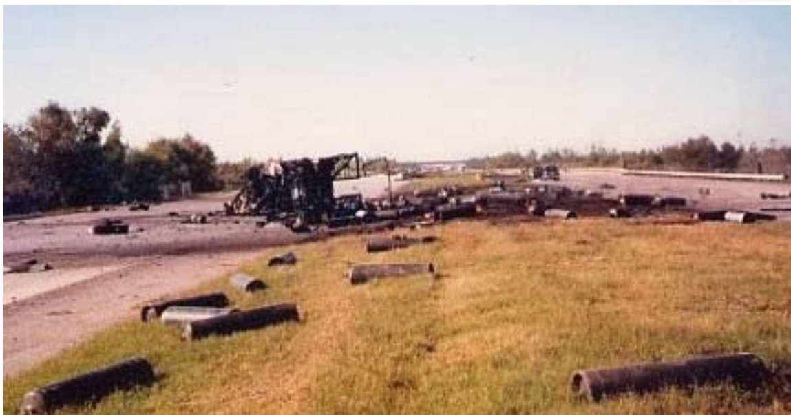
Figure 4. East New Orleans accident vehicle and cylinders.