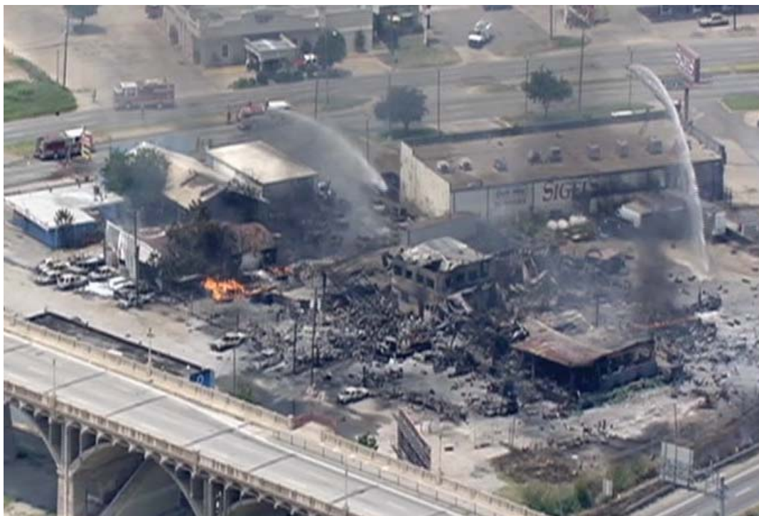
Figure 11. Final phase of fire suppression at Southwest facility in Dallas.